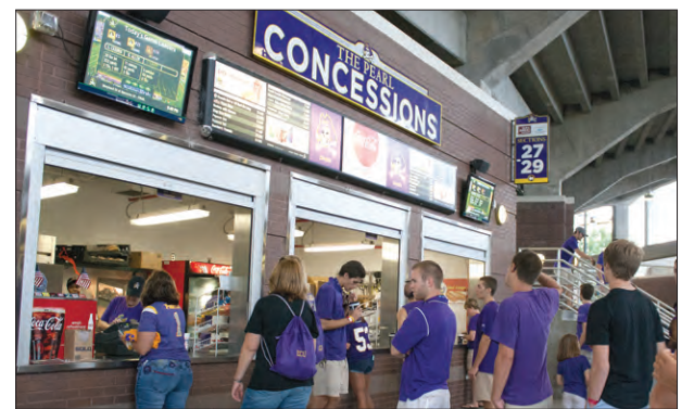
COURTNEY TITTUS | THE EAST CAROLINIAN

This writer can be contacted at news@theeastcarolinian.com.