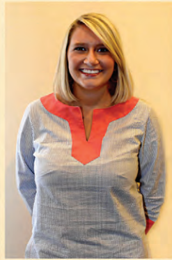
Haley Strickland Teaching Fellows & ECU Maynard Scholars