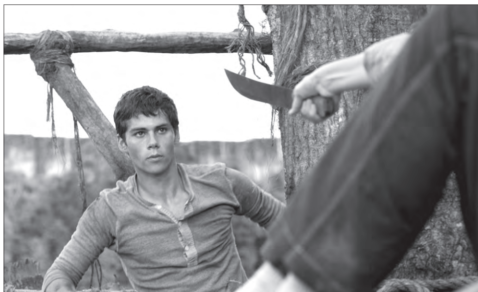
Dylan O'Brien (above) plays the role of Thomas who is trapped with fellow "runners" in a maze.