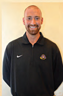
Carson Shepard Teaching Fellows & ECU Maynard Scholars