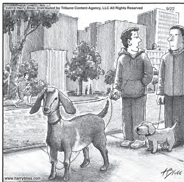
"We're trying to inject a little pastoralism into our lives."