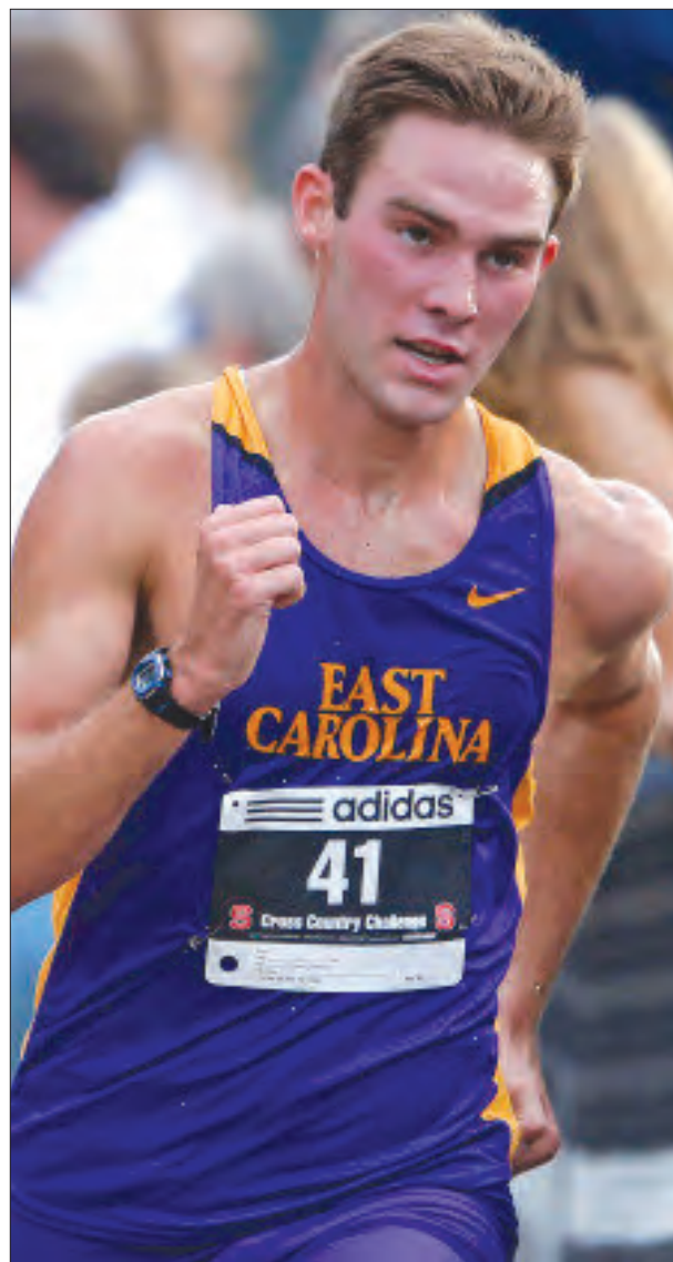
CONTRIBUTED BY ECU MEDIA RELATIONS

This writer can be contacted at sports@theeastcarolinian.com.