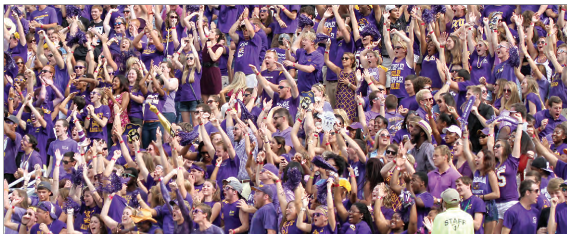
Dowdy-Ficklen saw its attendance record broken as 51,082 fans (mostly dressed in purple) filed into the confines.