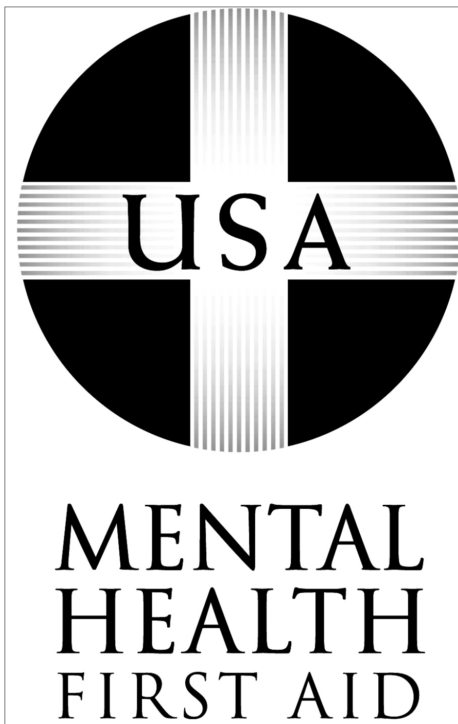
Pitt Community College hopes to raise mental health awareness by offering a new first aid course.