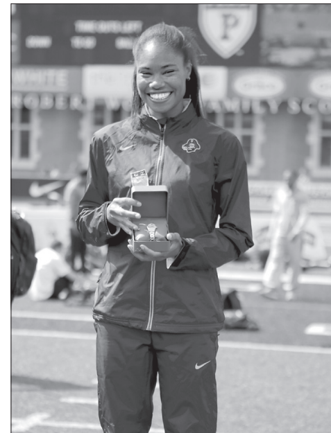
CONTRIBUTED BY ECU MEDIA RELATIONS

This writer can be contacted at sports@theeastcarolinian.com.