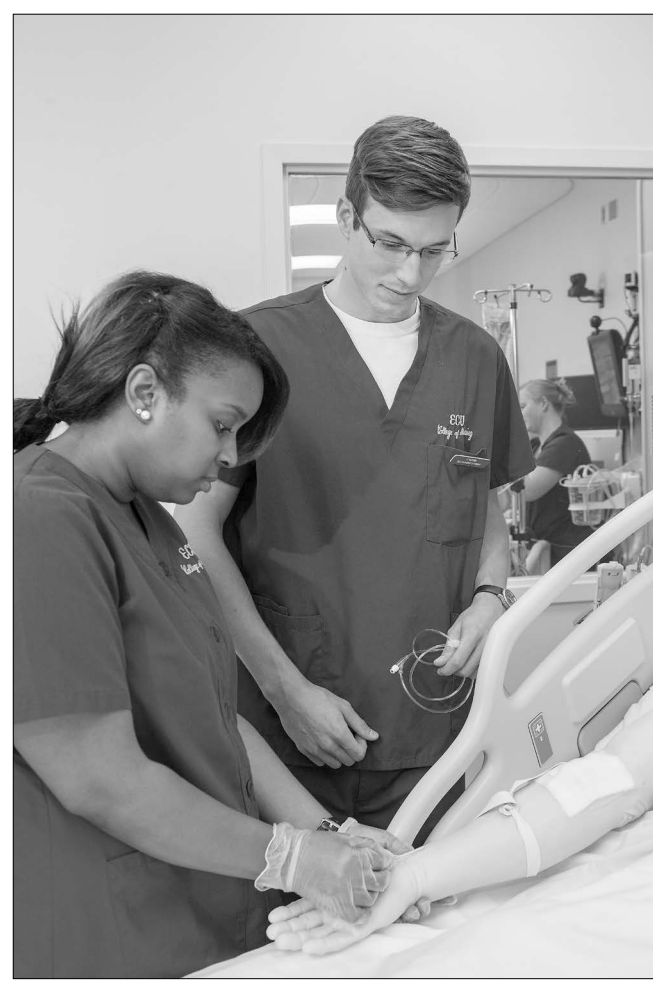
ECU's College of Nursing still registers the state's most nurses.