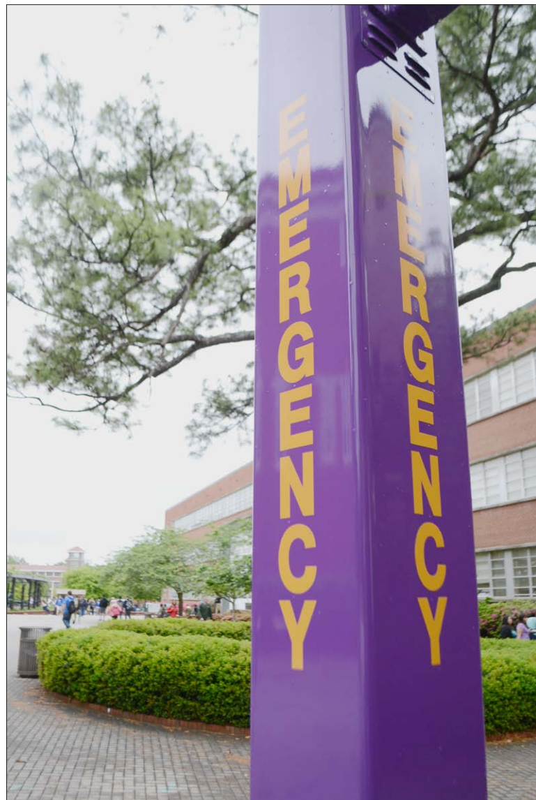
Students have been receiving numerous ECU Alerts about the off-campus crimes.

This writer can be contacted at news@theeastcarolinian.com .