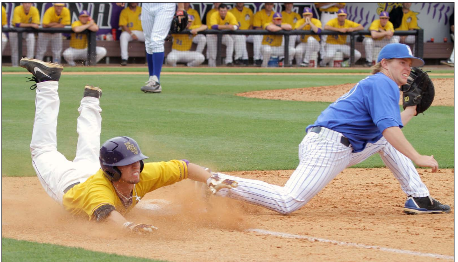
The Diamond Buccs (23-21, 8-7) used two straight 4-3 victories over the Memphis Tigers to win the three-game series in Clark-LeClair Stadium this weekend.