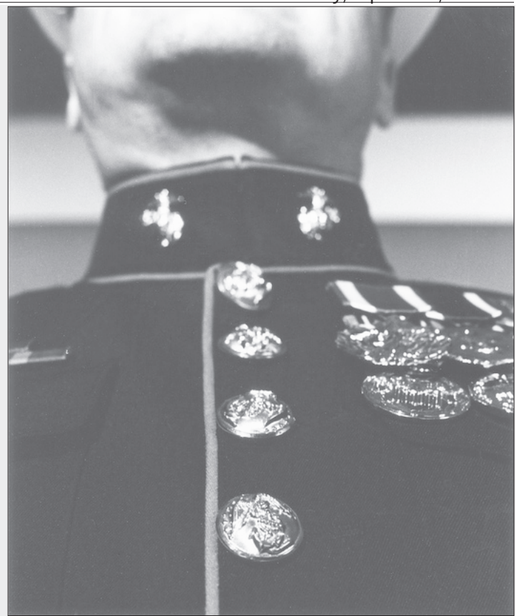
A unique view of a U.S. Marine as he stands under the American Flag.

Log onto theeastcarolinian.com to vote for next week’s photo of the week.