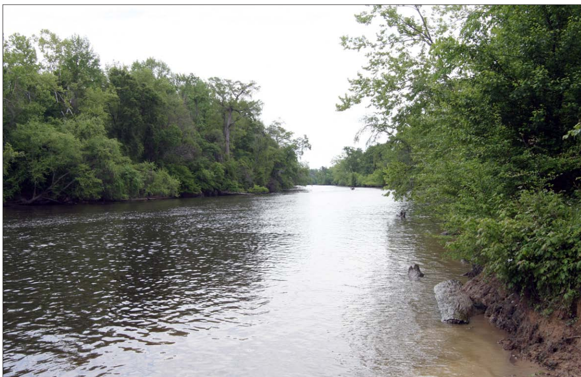
Revitalizing the Tar River area aims to increase utilization of the river to boost the economy and promote community.