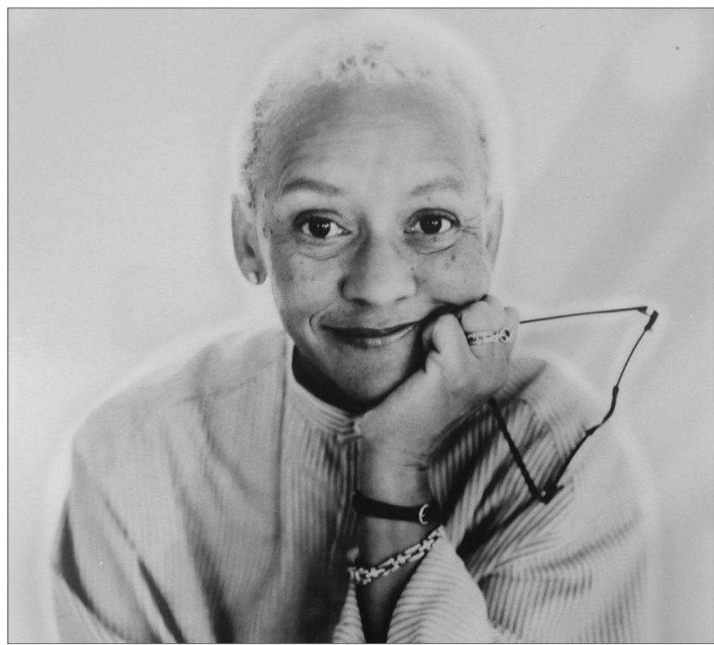
Nikki Giovanni, a world-renown activist, poet and educator, will speak in Wright on Wednesday night.

This writer can be contacted at lifestyles@theeastcarolinian.com.