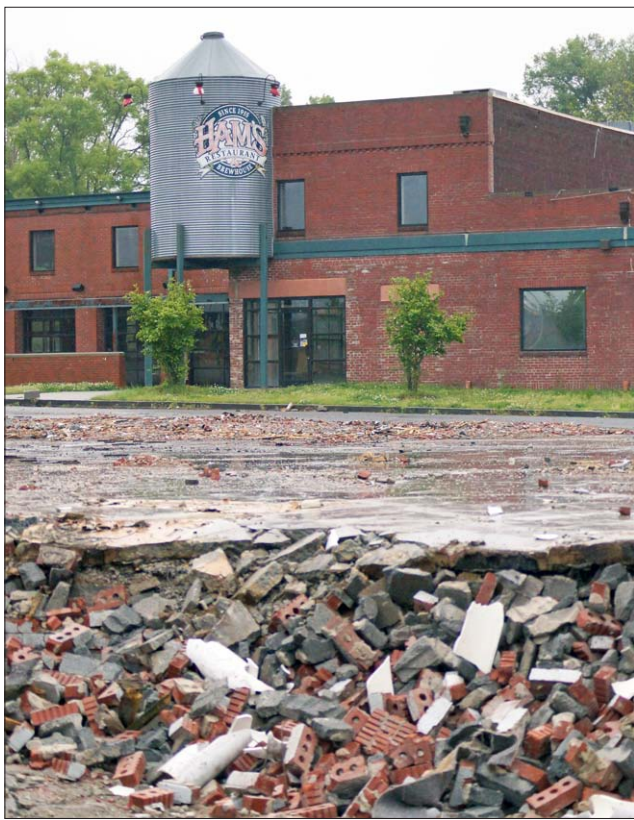
GARRETT CAMPBELL | THE EAST CAROLINIAN

This writer can be contacted at news@theeastcarolinian.com.