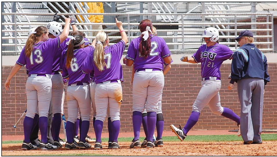
The Lady Pirates used back-to-back homeruns to finish the weekend sweep of the Memphis Tigers.