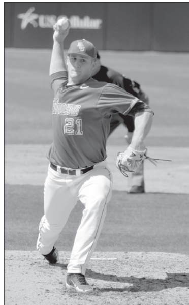
Pirates get back to .500 with the sweep.

The seventh inning rally started with a lead off single from