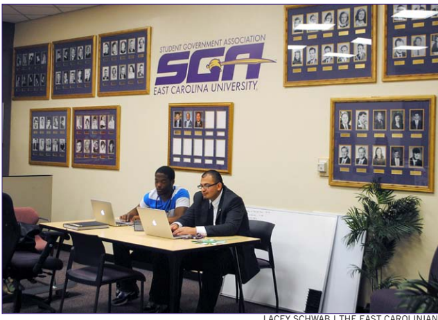
The new constitution aims to increase SGA in student lives.