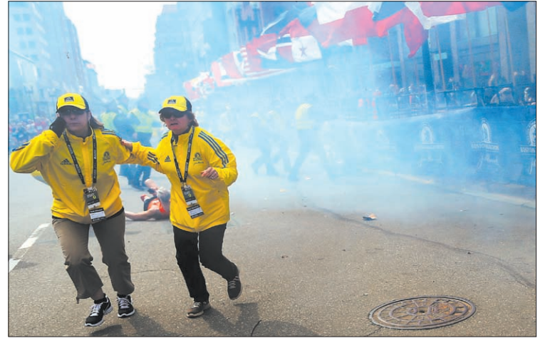
An ECU professor was among 23,000 people that competed in the marathon.

thon was lined with police officers every five to 10 feet, which made it easy to respond to the bombing. She praised the response of the police and coast guard to the situation.