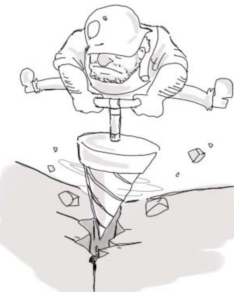
BRENT KOEHLER | THE EAST CAROLINIAN

I value our country's natural beauty just as much as the next person with a heart, but it is time to be audacious for once. Besides, if we set up oilrigs on every single hotspot in Alaska, it would still only affect a small fraction of wildlife in what is, by far, the largest state. Every inch of the 1.5 million square mile state is covered in