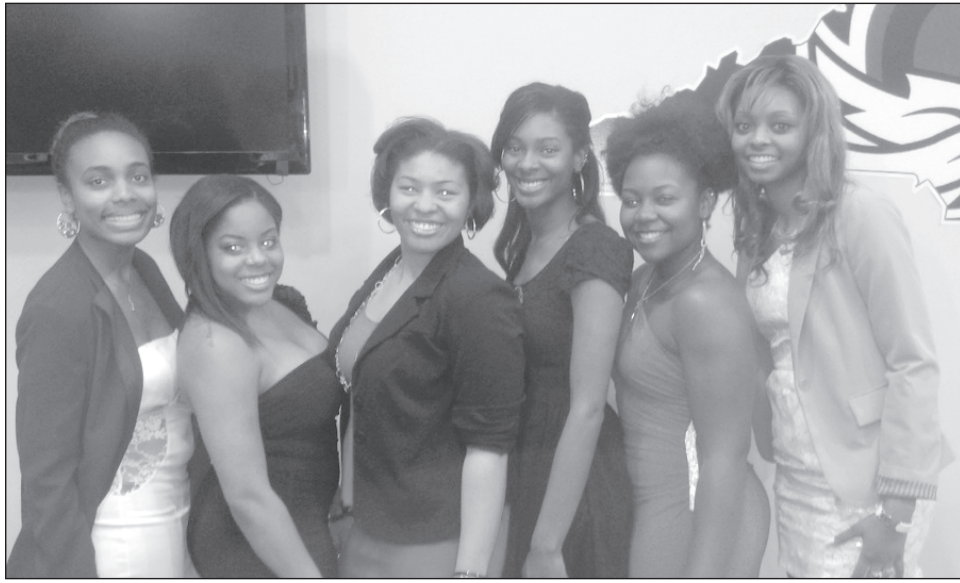
About 300 guests attended the ball, where students enjoyed food, awards and live entertainment.