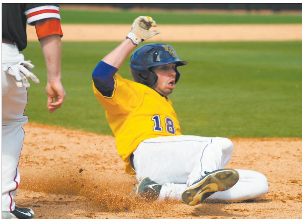
GARRETT CAMPBELL | THE EAST CAROLINIAN

Hits were again in no shortage for the Pirates, racking up eight runs off 13 hits, highlighted by a