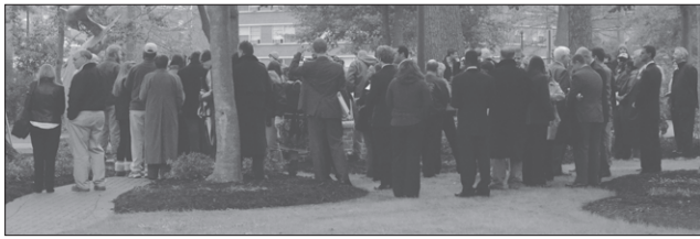
TORRE GRILLS | THE EAST CAROLINIAN