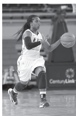
The Lady Pirates sit second in CUSA.

scoring column. ECU used a combine team effort to pull away from the Knights who only had one player score in double figures.