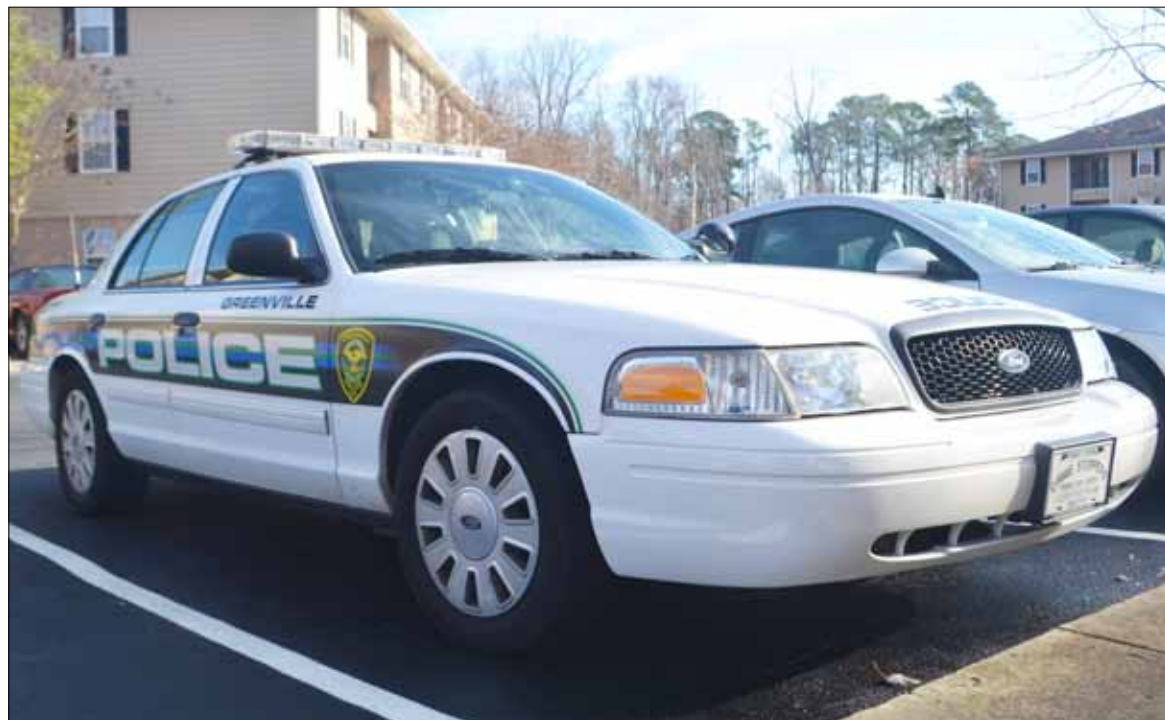
Student apartment complexes increase security during extended breaks, when break-ins are more likely to occur.

Off-campus student housing sees major hike in breaking and entering