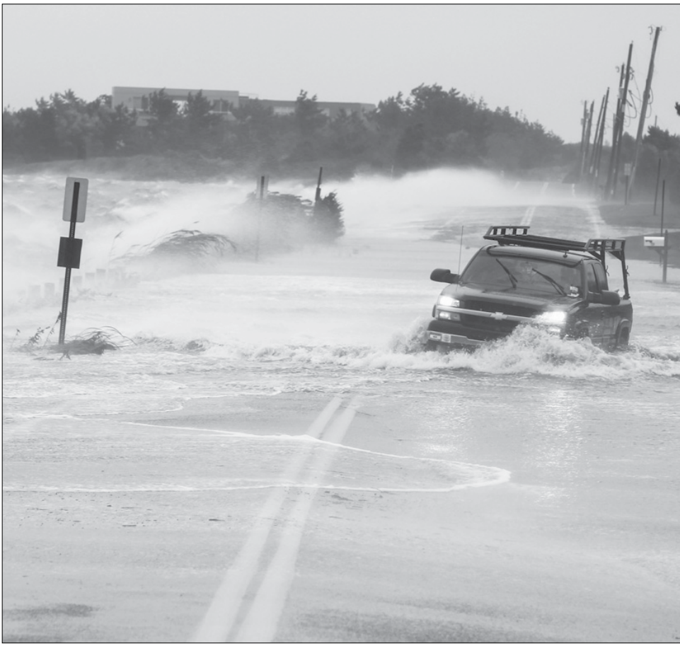
University students were affected by damage along the east coast left in Hurricane Sandy's wake.