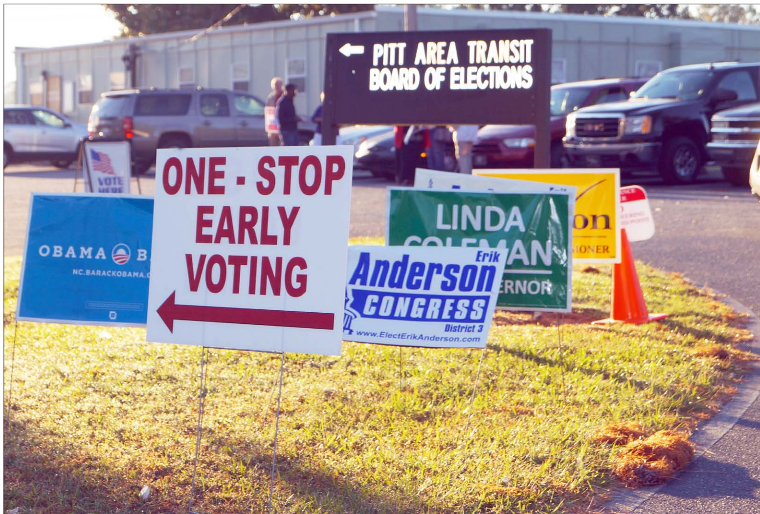
Campaign signs make a final pitch for their causes and candidates at a Pitt County early voting site in the hopes of swaying a few undecided voters.