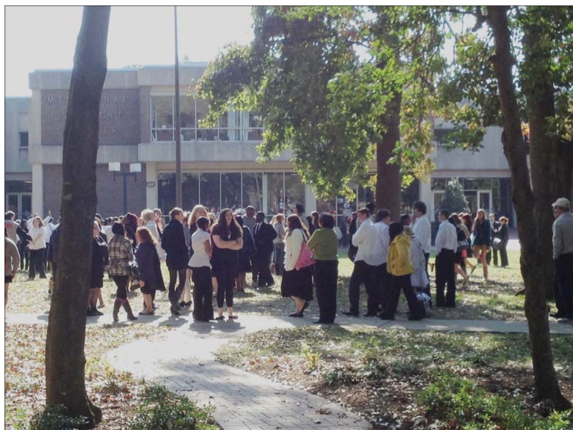
Students, faculty, staff and visitors wait in the Mendenhall brickyard shortly after being evacuated from the building.