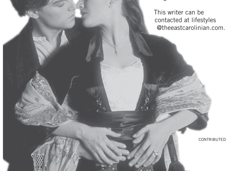
This writer can be contacted at lifestyles@theeastcarolinian.com .

will stay with those it touches for the rest of their lives. Seeing it on the big screen once more, in all its magnificent glory, is nothing short of a true honor.