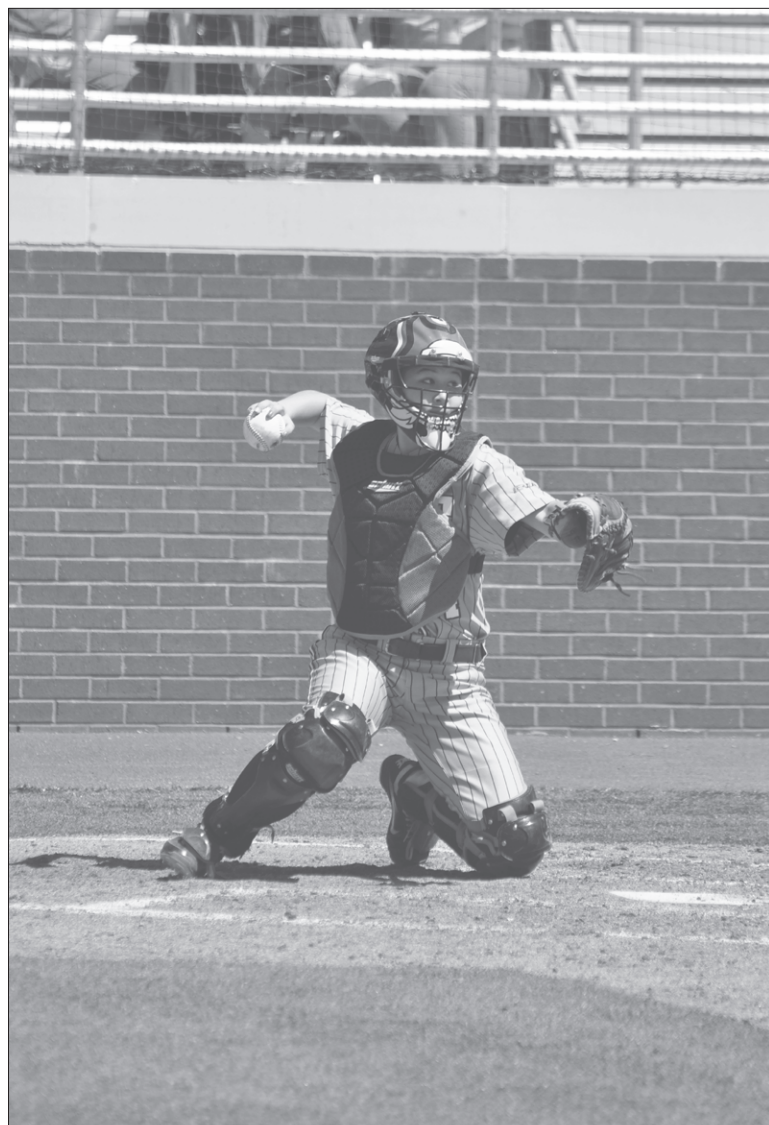
SERGEI TROFIMOV | THE EAST CAROLINIAN

This writer can be contacted at sports@theeastcarolinian.com.