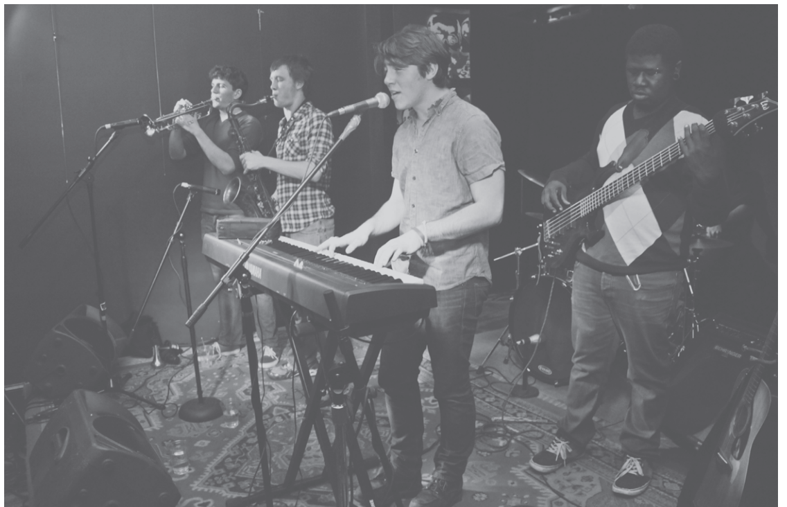
MADDIE TOMPKINS | THE EAST CAROLINIAN

In about 30 seconds, the atmosphere went from one of contentment to that of excitement as the band produced a jazzy