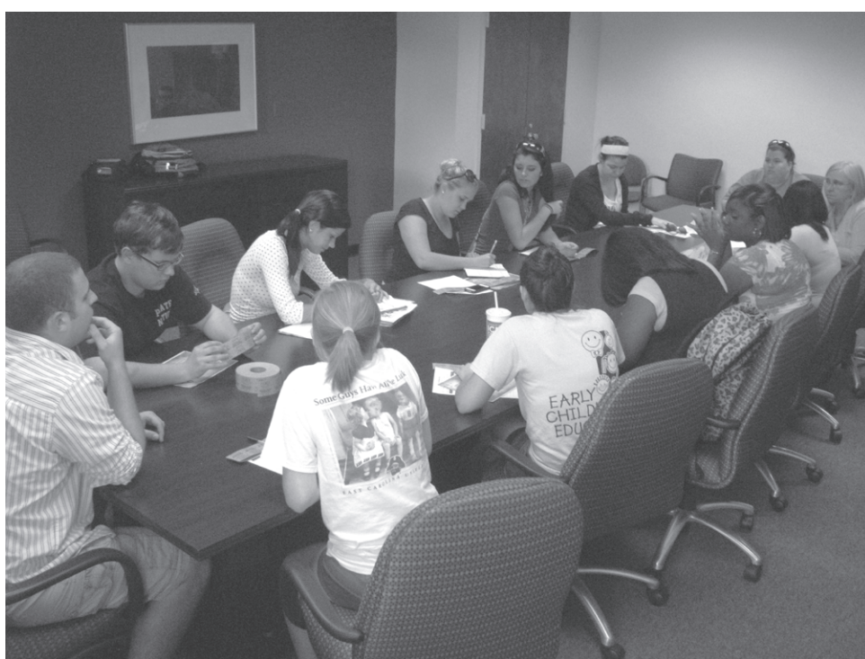
The Early Childhood Student Organization will host Hunt for a Cure tonight at 5 p.m. on campus.