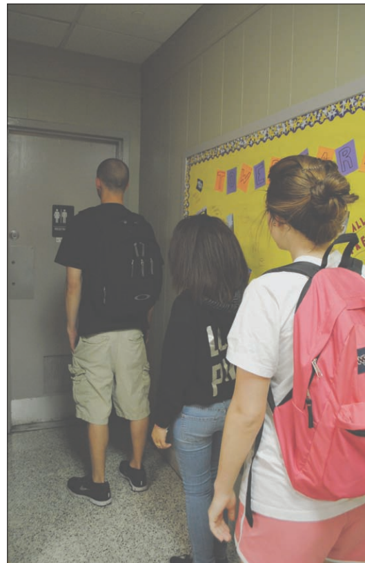
Students use a unisex bathroom in Clement Hall.