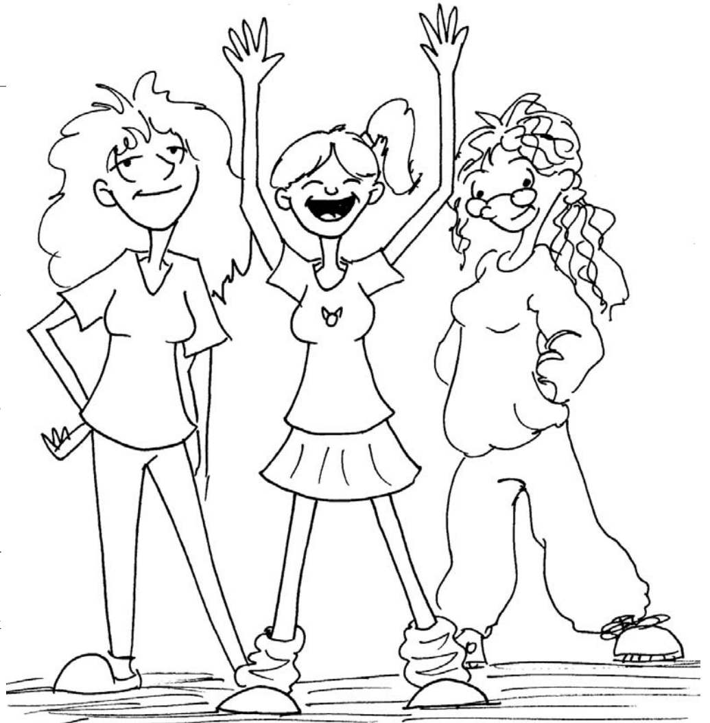
LISA TREADWAY | THE EAST CAROLINIAN

Along with understanding the mapping of gender-neutral bathrooms