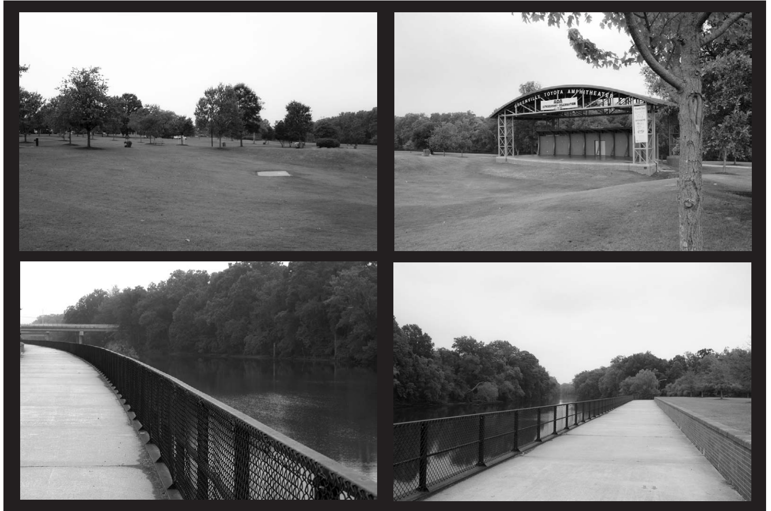
Town Commons features scenic paths through Greenville, in addition to an amphitheater, activity areas and a war memorial.