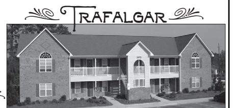
1 BR/1 BA & 2 BR/2 BA LOCATED ON COUNTRY HOME ROAD BEHIND SHEETZ