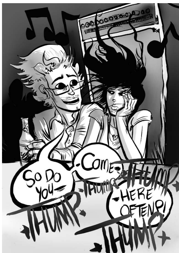
ILLUSTRATED BY TIMOTHY WEAVER

If volume makes for excitement, it does not make for intelligent thought. The Founding Fathers recognized that serious deliberation required silence when they ordered that the street in front of Independence Hall be covered with soil in order to muffle the sound of passing carriages. How might the Constitution have looked if it had been composed while muzak hummed in the speakers overhead? Loudness has always been associated with intolerance and brute force. Hitler himself claimed that he could never have conquered Germany without the loudspeaker.