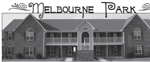
1 BR/1 BA & 2 BR/2 BA LOCATED ON WIMBLEDON DRIVE BESIDE FUDDRUCKERS