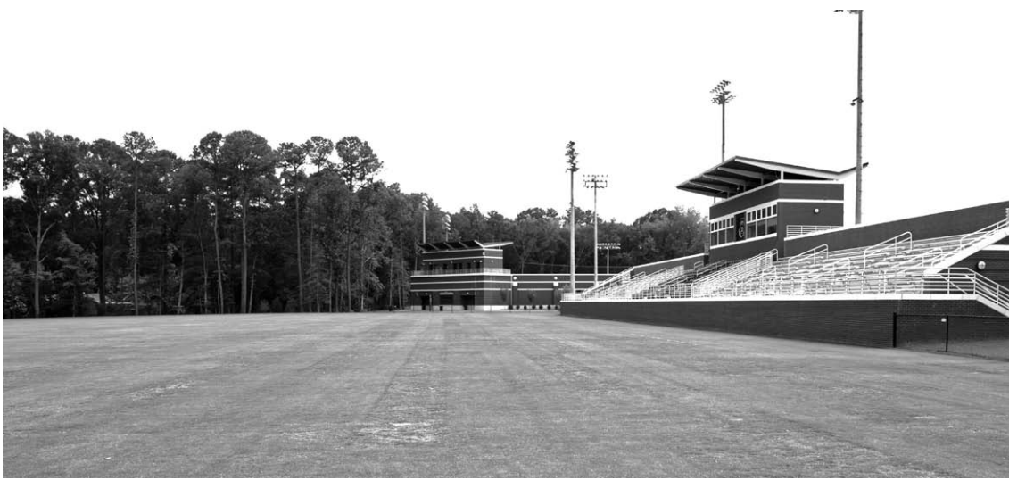
CASEY BOONE | FOR THE EAST CAROLINIAN

The new soccer stadium will be the next piece of the ECU Olympic Sports Complex project to be completed.