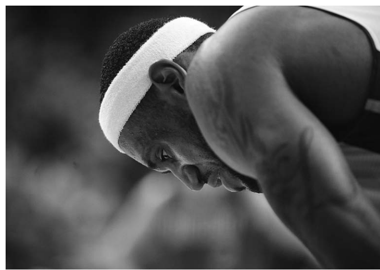
Lebron James tires during Game 6 of the NBA Finals.

Lebron James' numbers in Game 6 of the NBA Finals: 21 points, 6 assists, 4 rebounds, 1 steal, and 1 block. Insert those same statistical numbers, in the same situation, except this time, cover up the name who got those numbers. Would you think that was a great performance given the magnitude of the situation? If Mario Chalmers put up those numbers, would you say it was one of the best performances he had in