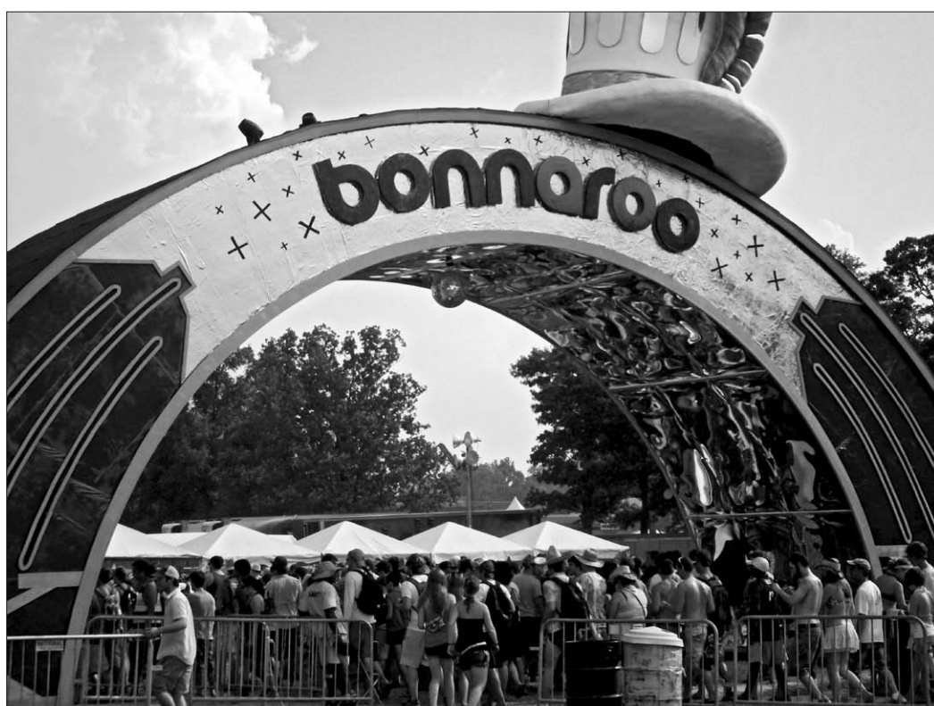
The shimmering archway welcomes music-enthusiasts to the 2011 Bonnaroo Music Festival in Manchester, TN.

This writer can be contacted at lifestyles@theeastcarolinian.com.