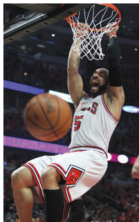
Chicago Bulls forward Carlos Boozer slams home a dunk in the second quarter of Game 1 of the Eastern Conference Finals on Sunday.

HAVE A QUESTION ABOUT THE SPORTS SECTION? CONTACT THE SPORTS EDITOR AT SPORTS@THEEASTCAROLINIAN.COM