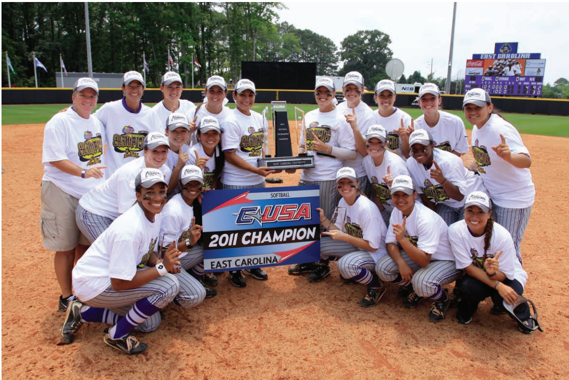
The ECU softball team celebrates its second consecutive CUSA Championship at home in Greenville on Saturday.