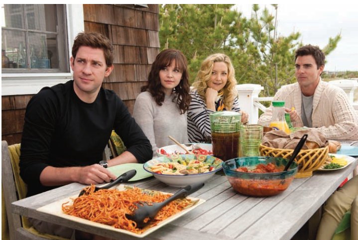
The cast of "Something Borrowed" share a moment in the summer romantic comedy.

Later in the movie, another childhood friend