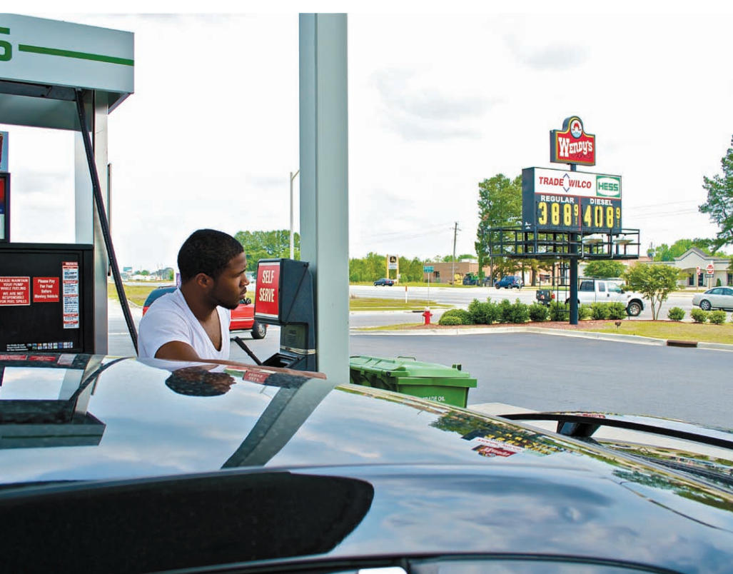
Local Greenville man fills up his tank at the gas station near North Campus Crossing.

Thankfully, North Carolina is a large state with much to offer its residents. From the Coastal Plains, through the Piedmont and up to the mountains, there is always something to do outdoors. Depending on one's geographic location, a trip to the beach, a golf course,