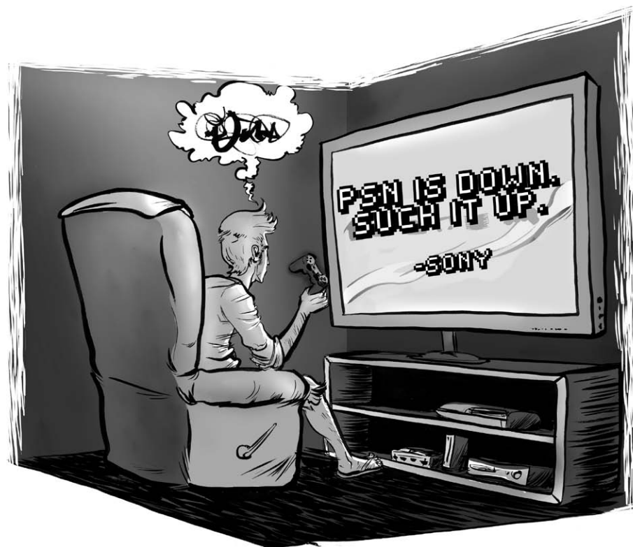
ILLUSTRATED BY TIMOTHY WEAVER

This writer can be contacted at opinion@theeastcarolinian.com .