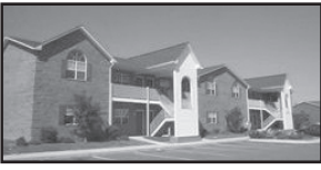
Cypress Gardens Gladious Gardens Monticello Court Moss Creek