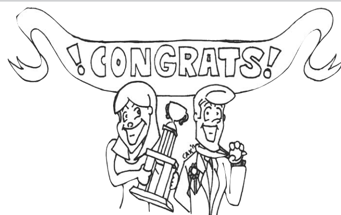
ILLUSTRATED BY ADRIAN PARHAMOVICH

The public editor can be contacted at publiceditor@theeastcarolinian.com .