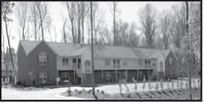
Park West Park Village Peony Gardens Rosemont