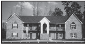
Cannon Court Cedar Court Cedar Creek College Park

3481-A South Evans Street, Greenville, NC 27834 1-2-3 BR Units Close to Campus & Medical School