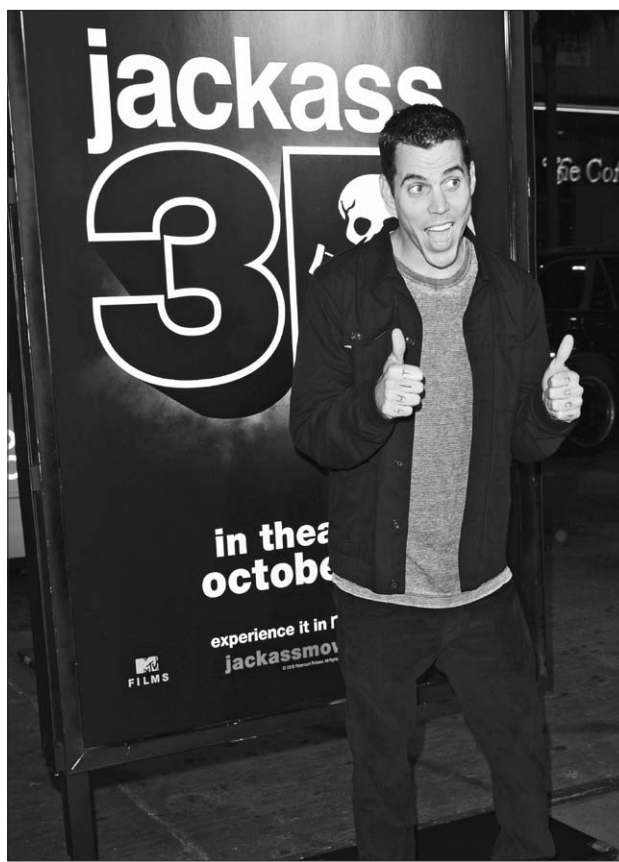
'Jackass 3D' star Steve-O poses at the movie's premiere.