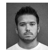
Stephen McNulty STAFF WRITER

Prediction of the top 5 NBA players of the 2010-11 season