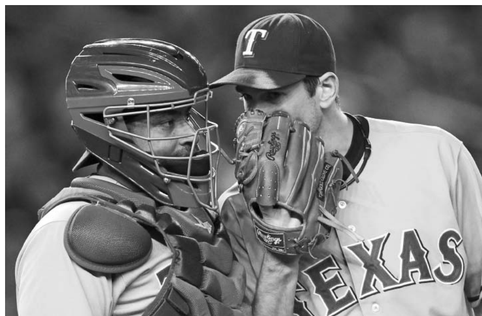
Texas Rangers' Cliff Lee throws against the New York Yankees in Game 3 of the American League Championship Series last Monday. Lee and the Rangers will square off with the San Francisco Giants in the 2010 World Series.

Cody Ross came out of nowhere. He was plucked off waivers in late August from the Marlins, only so he couldn't go to the Padres, and then was named the NLCS MVP in October. He