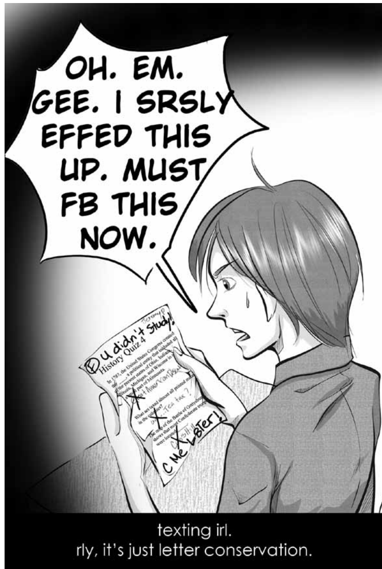
ILLUSTRATED BY ADRIAN PARHAMOVICH