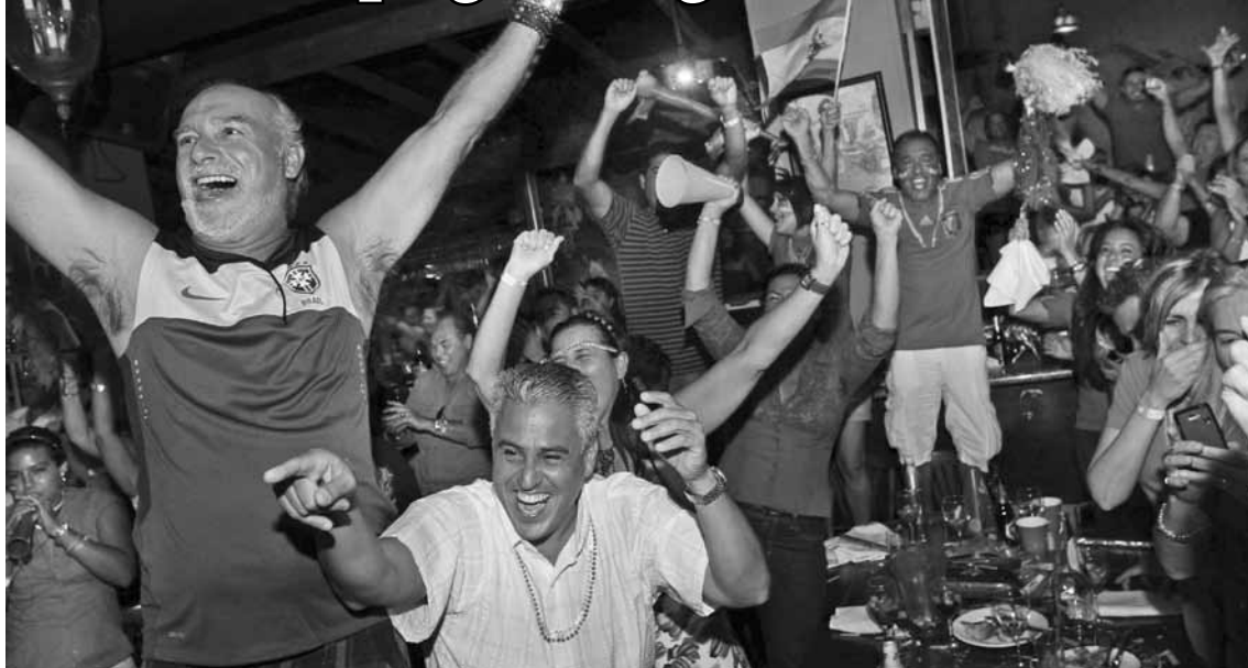
Spanish fans in Hollywood, Fla., rejoice as Spain defeated the Netherlands, 1-0, to clinch their first-ever World Cup on Sunday.