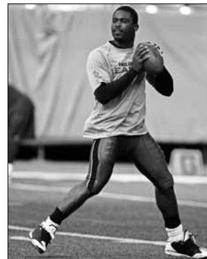
Seen here practicing, Michael Vick has gone from prison to a halfway home to becoming a Philadelphia Eagle in the last few years.

events for Vick would soon unravel and reveal him for what he truly was and what he truly had done.