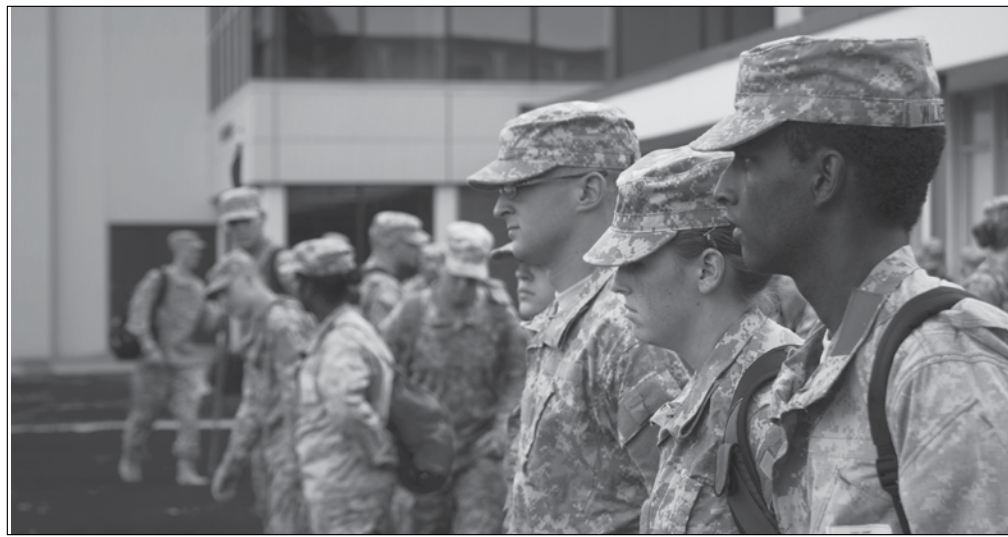
Participating in ROTC is another way veterans are getting their college paid for before and after service.

This writer can be contacted at news@theeastcarolinian.com .