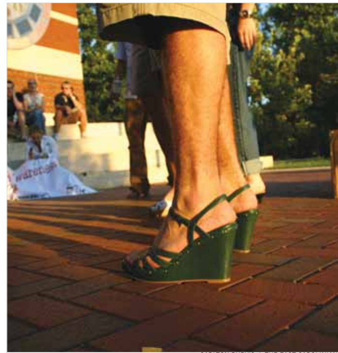
CARLTON PURVIS | THE EAST CAROLINIAN