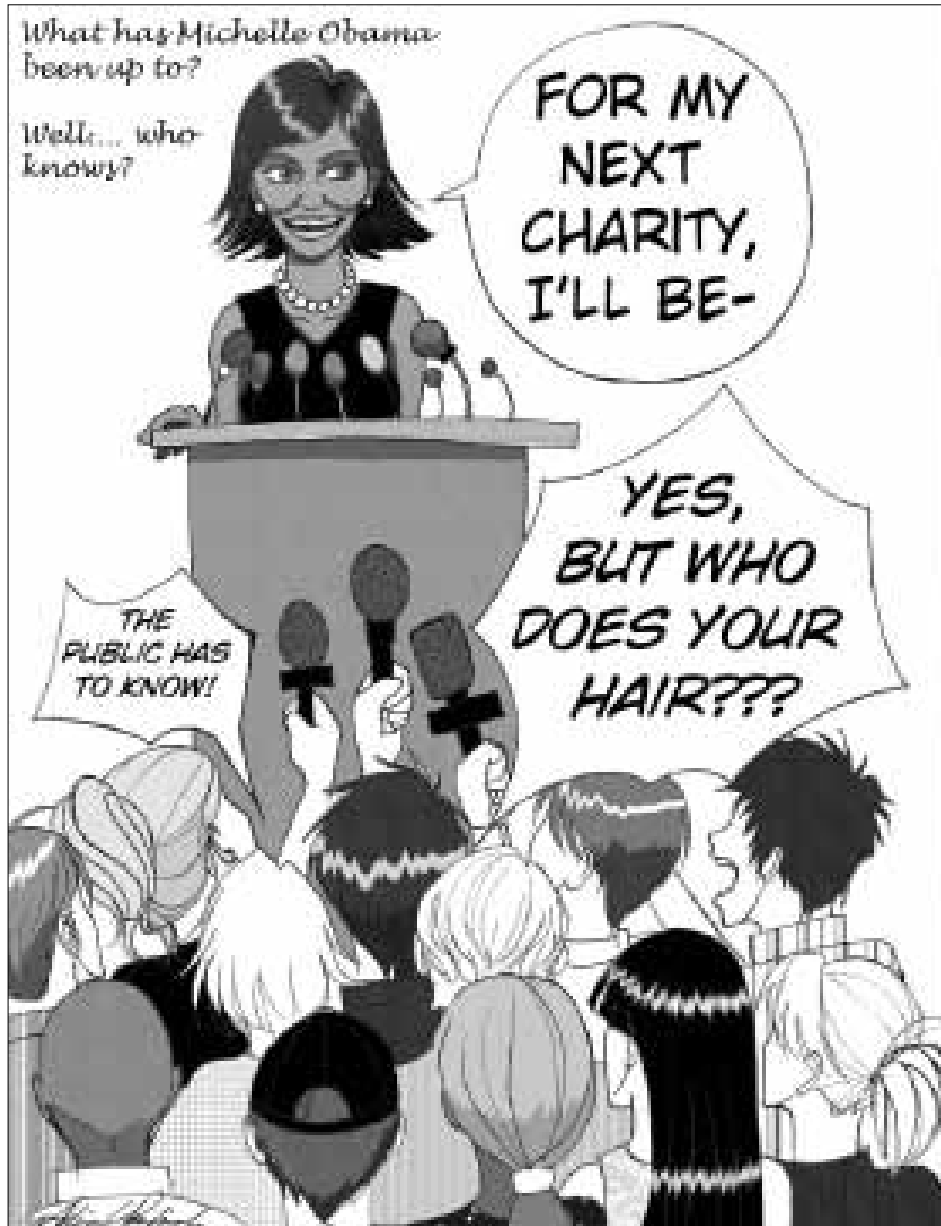
ILLUSTRATED BY ADRIAN PARHAMOVICH

You are the biggest crybaby I know! I hope someday you grow your balls back and realize how pathetic you look with your sad Facebook statuses and whiney conversations with me.