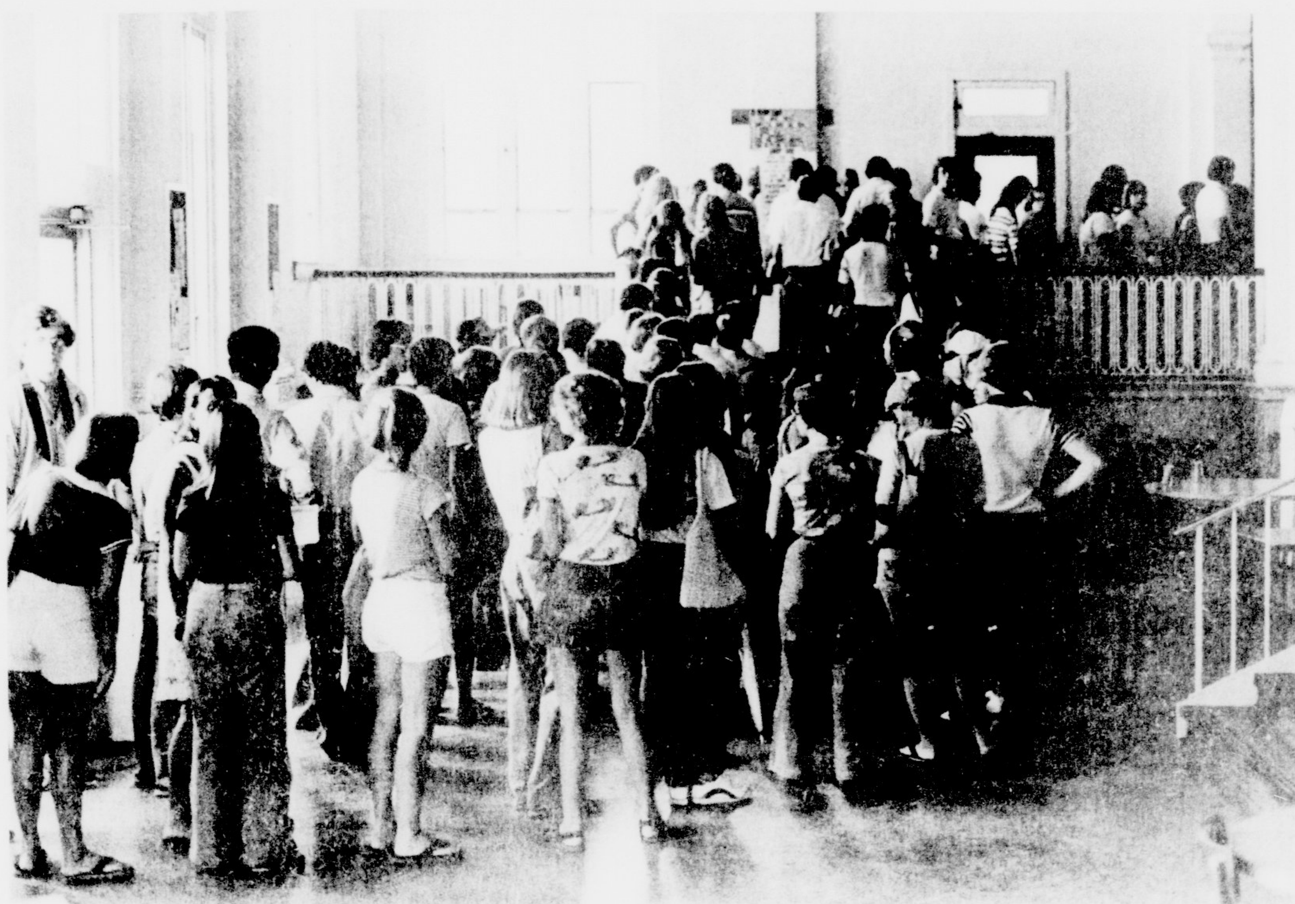
To avoid long lines like are pictured above, students are advised to pre-register for Summer School and Fall Semester.

CHANGE OF MAJOR — February 23 - March 6, 1981 PREREGISTRATION — March 2 - March 6, 1981 ONLY STUDENTS CURRENTLY ENROLLED MAY PREREGISTER