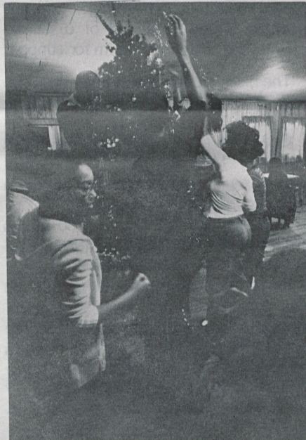
TIS THE SEASON...