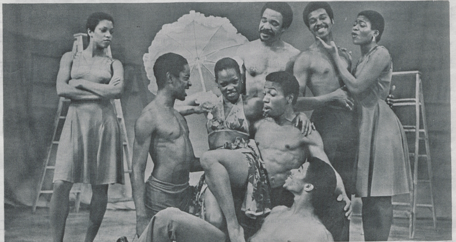
"DON'T BOTHER ME..."