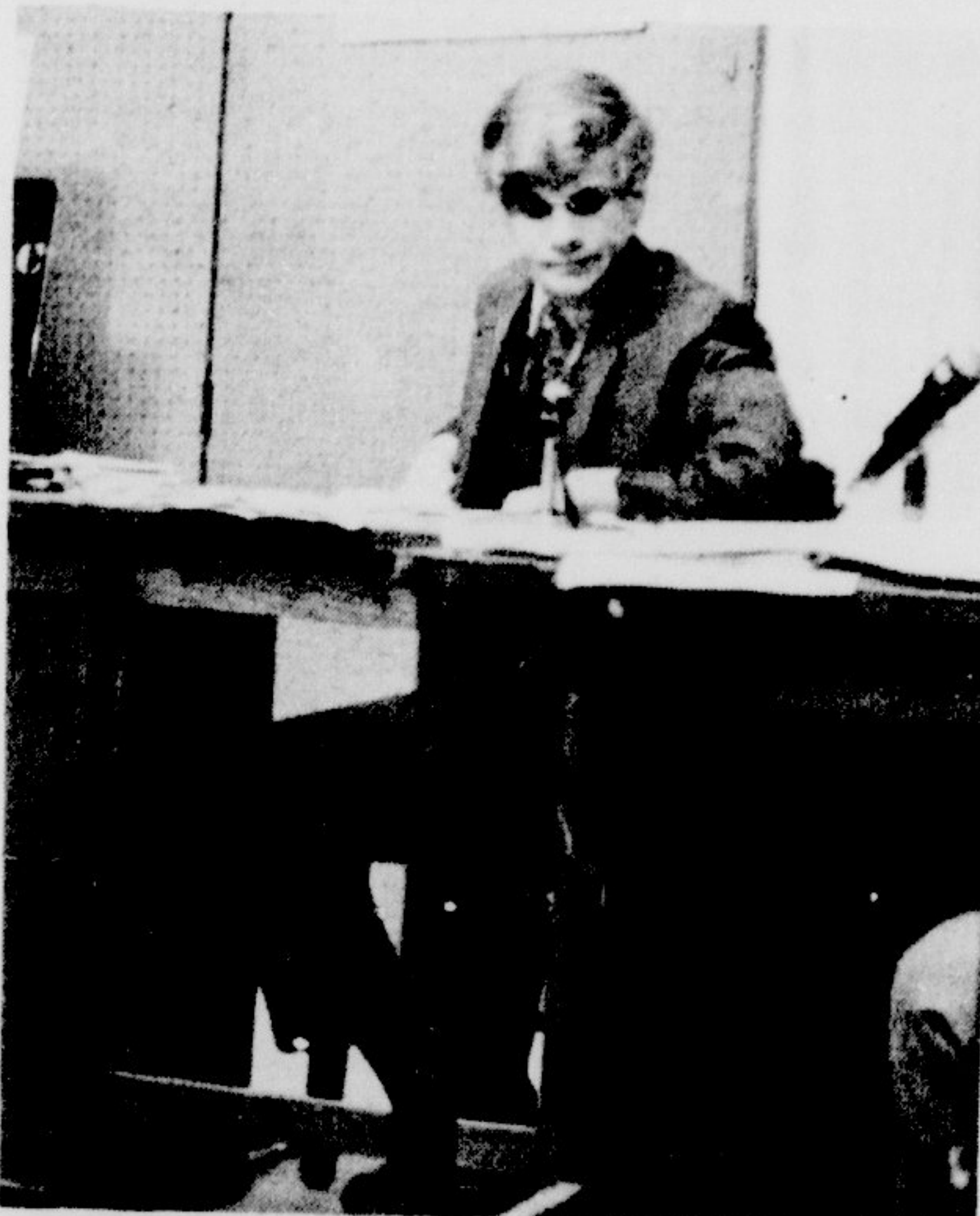
ELECTION CENTRAL is a busy sight during the election night returns. Coverage of the election returns began as soon as the polls opened on campus and were closely followed by many students on close circuit television until they closed.