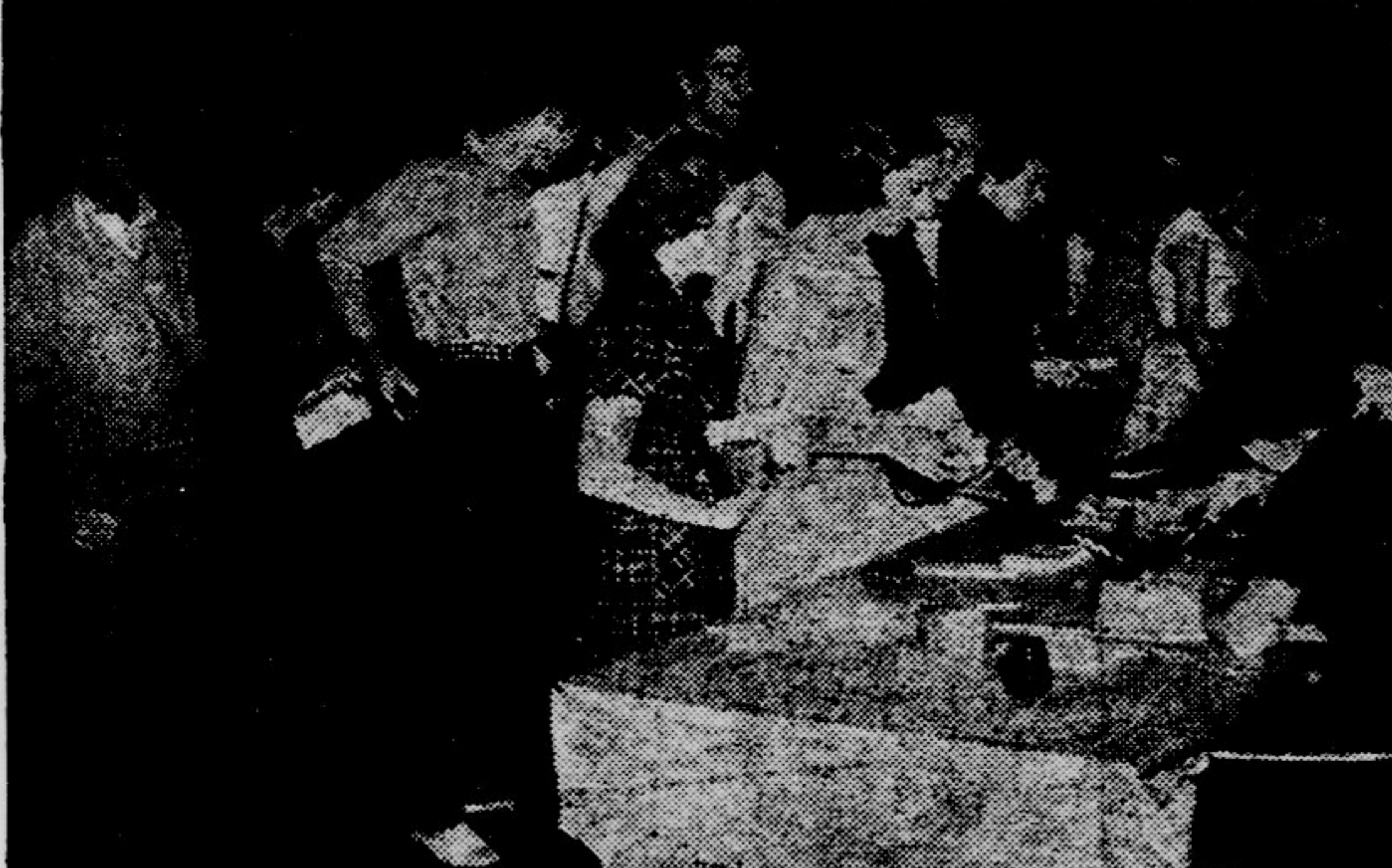
Lines such as the ones pictured above were not unusual during the registration periods last week as East Carolina once again broke the previous enrollment figures. For the first time in the history of the college, there are over 2,000 students doing work on the campus.