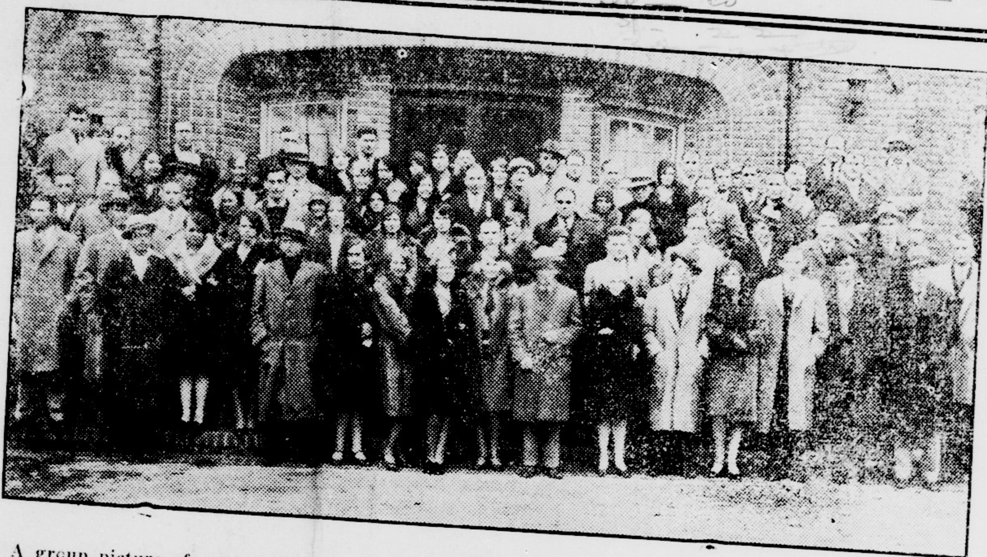
A group picture of a portion of the delegates to the North Carolina Collegiate Press Association. The semi-annual convention was held recently at Lenoir-Rhyne College, at Hickory, N. C.

"The End of a Perfect Day" "That's an example of something pleasure bent," remarked the father as he gazed at his son's sport roadster wrapped around a telegraph pole.