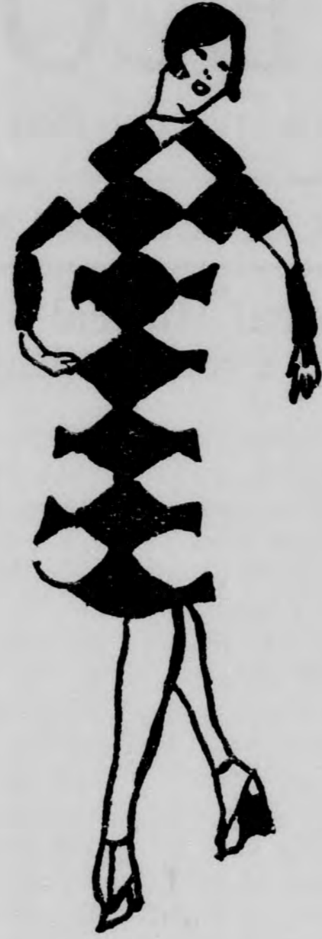
KATE KALKILATE SAYS:

You may not believe in evolution, but exam time is no time to be monkey-ing around.