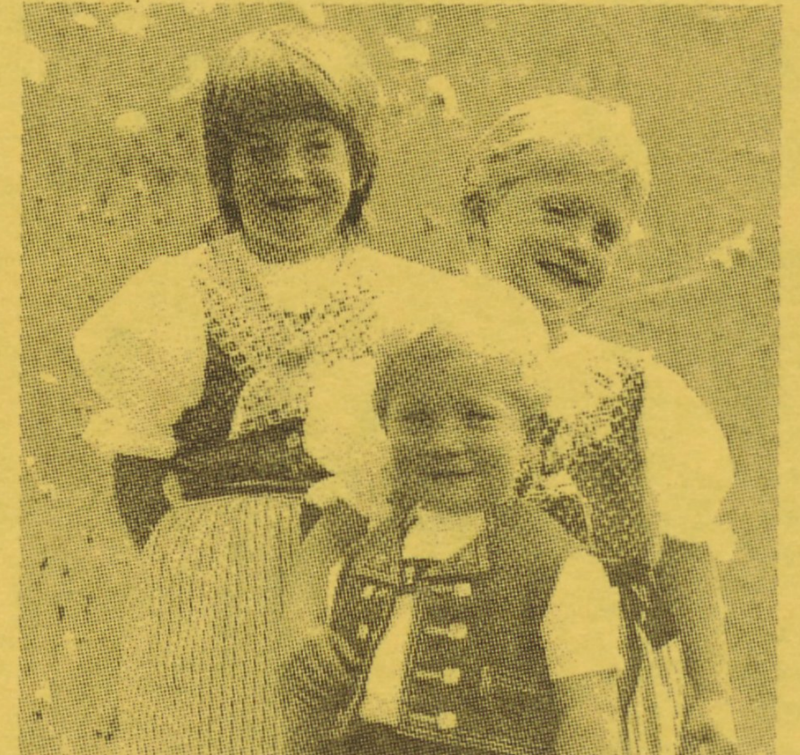
Project participants will share the love of Christ with the Russian people.

November, 1989. The production features a cast of 90 actors, actresses, singers, and dancers, and a variety of animals including camels and horses to present a spectacular show in a state-of-the-art outdoor amphitheater. The marvelous story of the birth, life and ministry of our Lord comes alive on the stage as a Grandfather tells the ageless story to his grandchildren.