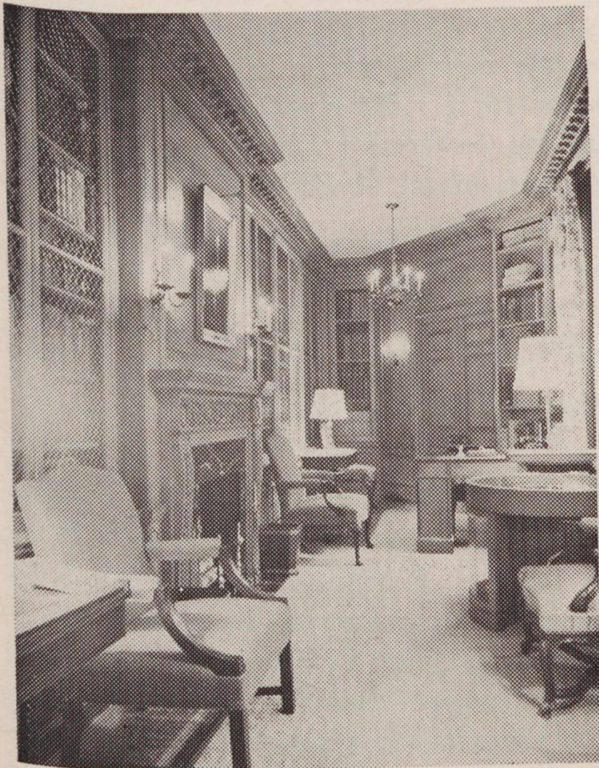
The Trent Room, Medical Center Library, Duke University.