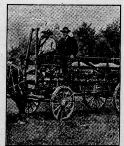
YOUNG FARMER ON HIS WAY TO MARKET WITH A LOAD OF SHEEP.

The opportunities of the farm are not limited in size or extent. The young man with capital who is looking