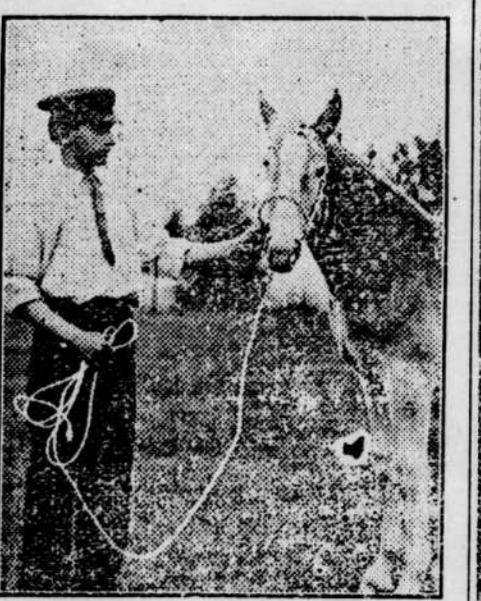
THERE IS NO LINE OF FARMING MORE FASCINATING THAN THE BREEDING OF PURE BRED LIVE STOCK.

The most optimistic resident would have laughed at the idea of there being any opportunity there. But the young man went to work. He did not lecture to the neighbors or advise them. He merely set out to show them what the impoverished land was capable of. He made the old farm pay, and its dilapidation changed to an air of prosperity. His neighbors gradually began to follow his methods and to catch some of his spirit. The community started to go forward instead of backward. As soon as he could spare the time from his farm the young farmer set about reorganizing the village school. He gave one corner of