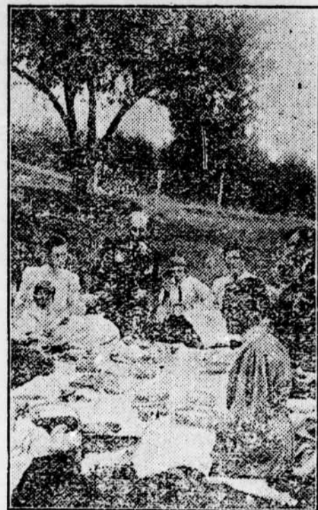
FARMERS' PICNIC DINNER ON THE GRASS. In too many places each family is content to live by itself, with as little intercourse as possible with the neighbors. It is

The social possibilities of the country are not taken advantage of in all com-