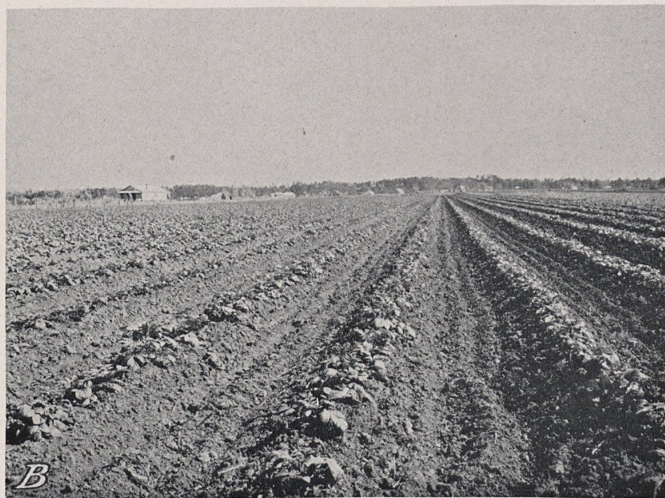
A, Cabbage on Moyock fine sandy loam northeast of Bayboro; B, potatoes on Bayboro loam.