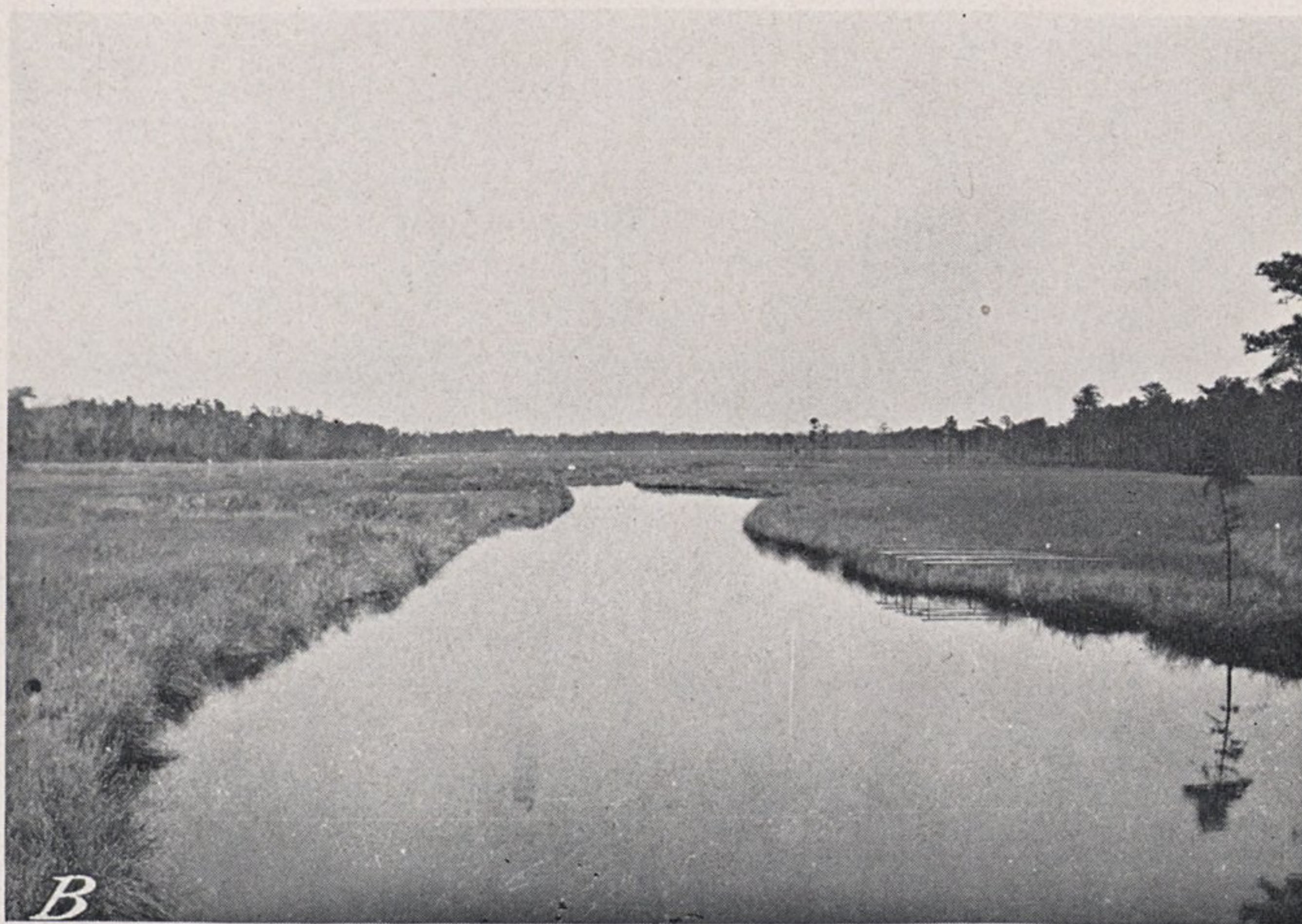
A, Typical view of cut-over timberland on Leon fine sand near Grantsboro; B, tidal marsh northeast of the Trent River bridge.

streaked with brownish yellow, heavy plastic clay or heavy plastic fine sandy clay. Below a depth of about 40 inches, the brownish-yellow streaks largely disappear. In some places, at the lower depths, fragments of shells or marl occur, but generally the underlying material is heavy gray or steel-gray clay. In places where this soil borders Hyde loam and the Portsmouth soils, the subsoil is heavy plastic fine sandy clay to a depth of 12 or 15 inches.