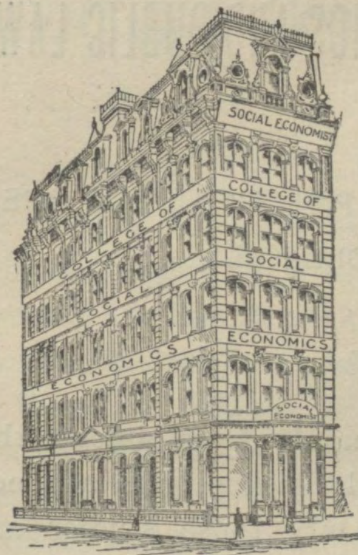
SOCIAL ECONOMIST BUILDING.

The "SOCIAL ECONOMIST," a monthly magazine edited by President Gunton and Starr Hoyt Nichols, treats subjects allied to Economics. The price is 20 cents per copy or $2.00 per annum. Sold by all dealers. Sample copies free.