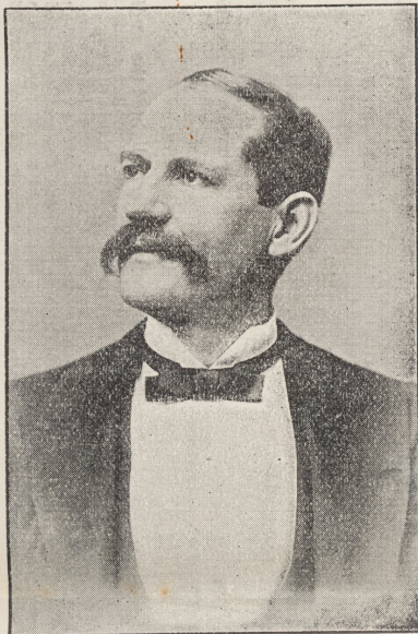
POLK MILLER, (Virginia.)