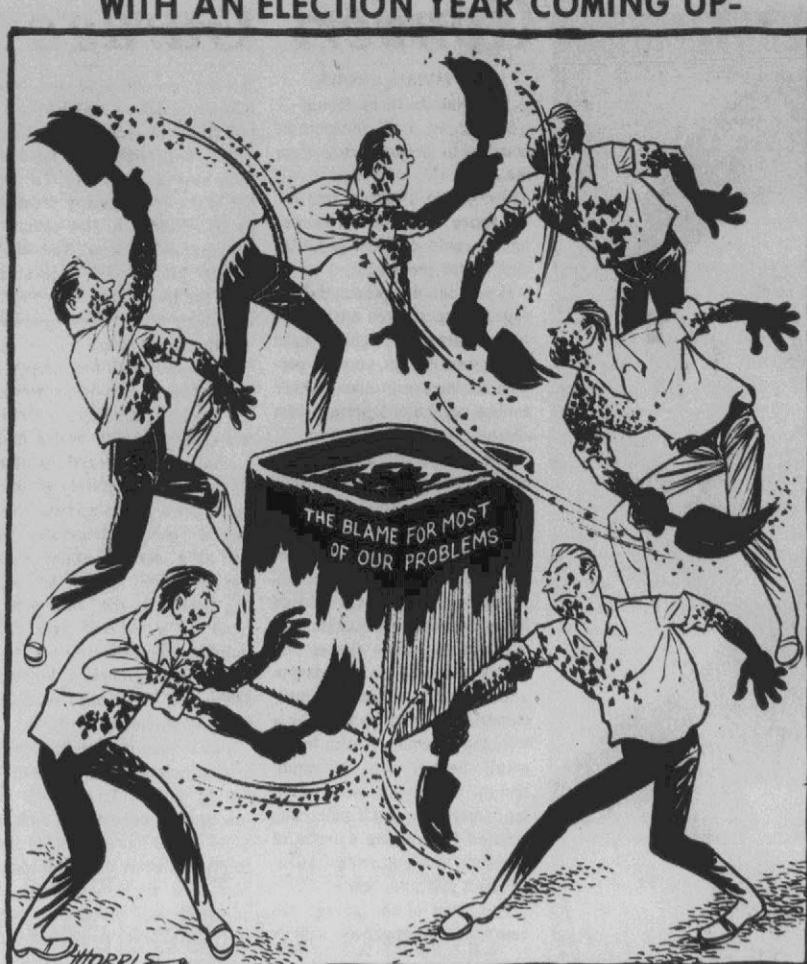
By ART BUCHWALD