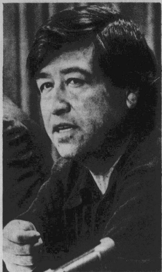
CALLING NEW BOYCOTT —United Farm Workers leader Cesar Chavez told reporters in Sacramento Wednesday he has called for a new UFW international boycott against selected raisin, grape and fruit growers because of their opposition to California's farm labor board.

Mobile Bay, which extends into southwest Alabama, is 35 miles long.