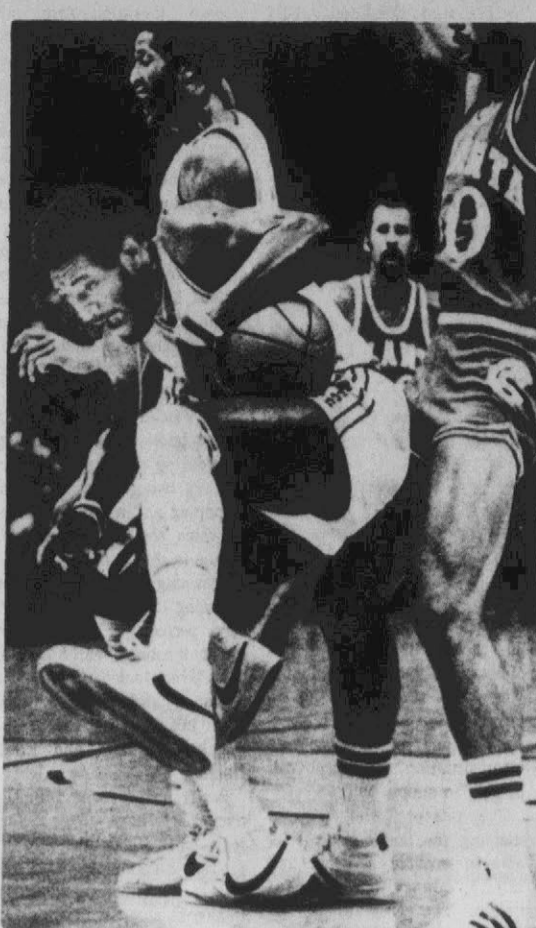
CLIFF GETS HIS REBOUND — Golden State Warriors' center Clifford Ray comes down with the rebound, tucks it away, and nudges Atlanta Hawks' John Brown (50) off balance in first half action at the Oakland Coliseum Thursday night. Behind Ray is Warriors forward Jamaal Wilkes (41). Golden State won the game, 113-104.

But an important part of the tournament is the home court advantage for the first round. Whether the Bucs have a shot at a home court berth or not will be decided tomorrow night.