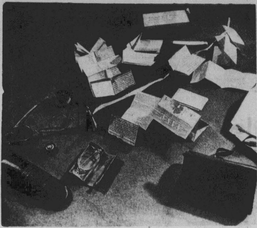
LINCOLN'S MEMORABILIA —This is the contents of a mystery box, containing the things Abraham Lincoln carried in his pockets when he was assassinated, that was opened for the first time at the Library of Congress in Washington Thursday—the 167th anniversary of his birth.

The most intriguing item turned out to be a $5 Confederate bill, right center. Other items included newspaper clippings, eyeglasses, a penknife and what appeared to be a watch fob.