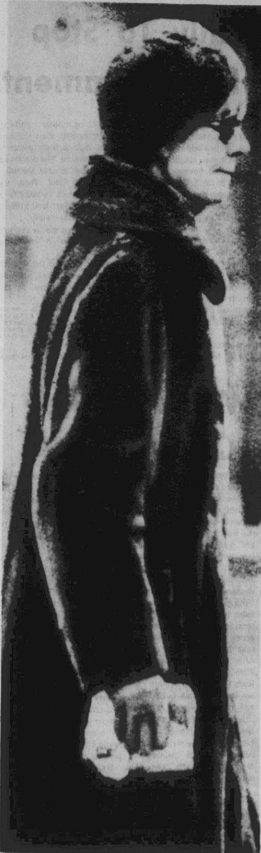
FIGURE FROM YESTERDAY —The milk-clad figure in sunglasses breezing along a New York City street Thursday is none other than Greta Garbo. The former movie queen who is now 71, left Hollywood for a life of seclusion more than 30 years ago.