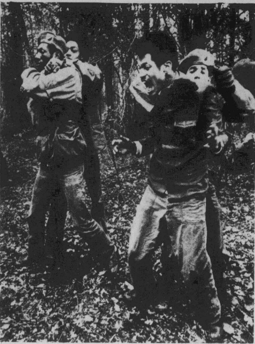
ANGOLA VOLUNTEERS—Volunteers with the Veterans Opportunity Project take training in hand-to-hand combat in Fairfax County Wednesday. The group is affiliated with the Congress for Racial Equality and hopes to send 1,500 men from the Washington, D.C. area to Angola.