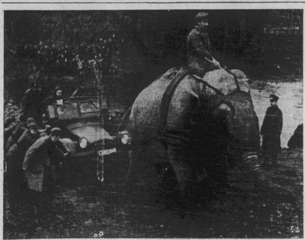
Nazi military might bogged down in a muddy field near Hamburg during an anti-tank company's maneuvers, and this elephant from a nearby zoo hepled salvage the army truck.