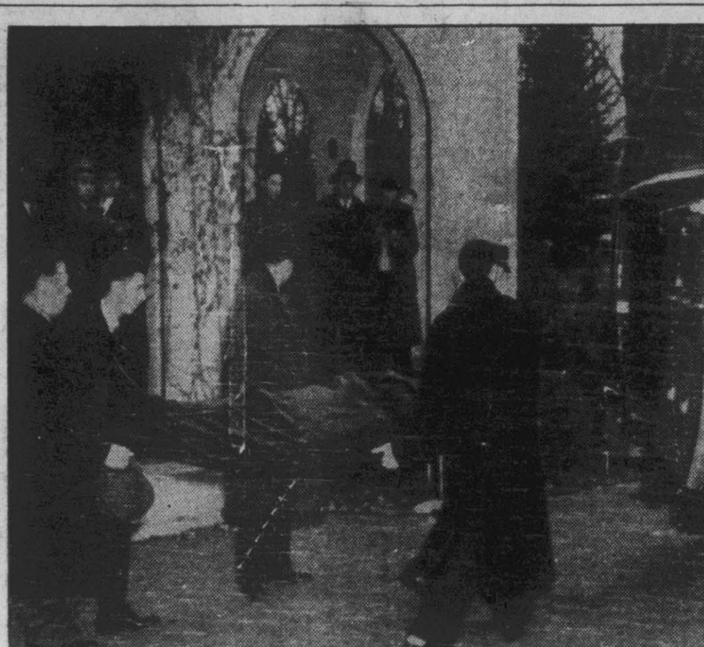
The body of Philip Musica—ex-convict who, as F. Donald Coster, was president of McKesson and Robbins, Inc., and a respected citizen of Fairfield, Conn.—here is carried from the palatial Coster country home near Fairfield to a waiting hearse. Indicted for violation of the Securities Act of 1934, his real name and past criminal record revealed and awaiting re-arrest in connection with the investigation at New York of the financial affairs of the huge concern he headed, Coster shot himself to death in the bathroom of his residence, police reported.