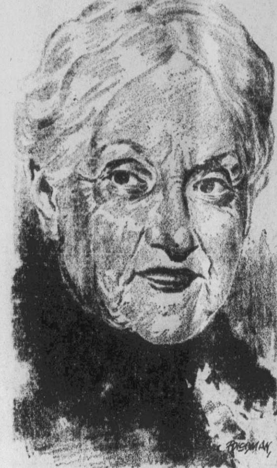
REBECCA FELTON, BORN IN DEKALB COUNTY, GEORGIA IN 1835, ESTABLISHED A UNIQUE RECORD AS 1ST WOMAN SENATOR SHE SERVED BUT TWO DAYS.

On November 21, 1922, MRS. REBECCA FELTON of Georgia was sworn into the United States Senate, the first woman ever to take oath of office in that body. Previously, she had won recognition for her writings; and her skillful propaganda won the election of her husband to the Senate, although he was