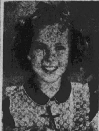
Shirley Temple poses proudly with her pet who plays with her in "Just Around the Corner," opening Pitt Monday.

WANTS Rates 1 1/2¢ per word, minimum charge 35¢ for 25 words, one insertion; six insertions $1.85; one month, $7.00. Indented lines, known as classified display, or larger than regular size type, double price. Other than to business houses having regular accounts with us, no want ads will be charged. Send or bring cash with order. To prevent errors, want ads will not be taken over the telephone.