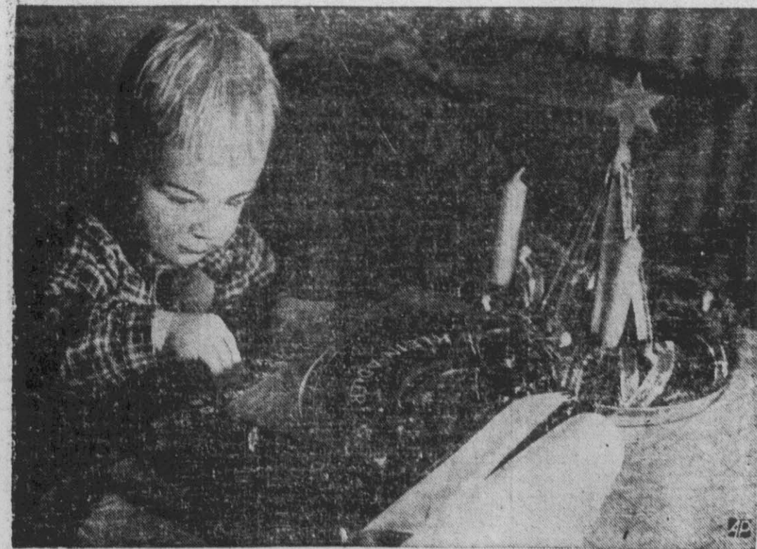
A NEW NAZI FUEHRER —the German Santa Claus—seems to have slightly eclipsed Hitler in Berlin where this young Aryan is typing off a list of Christmas requirements.