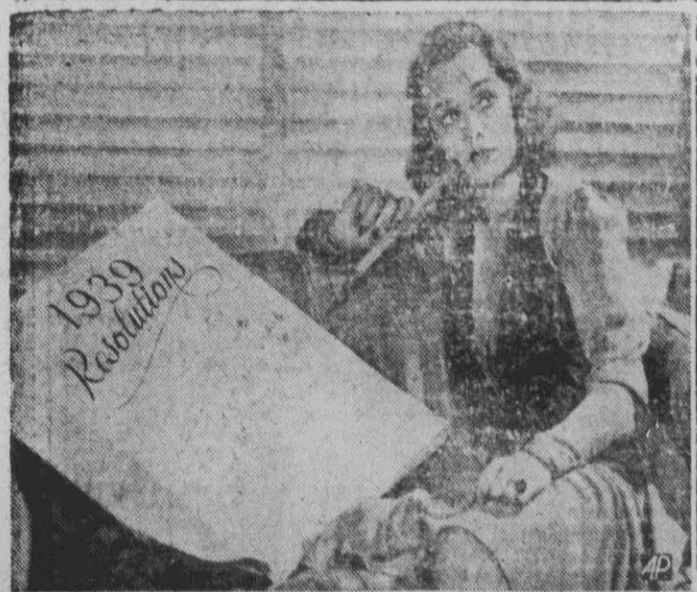
EATING BETWEEN MEALS is a do-not on list of Film Actress Jane Wyman, who's ready for New Year.