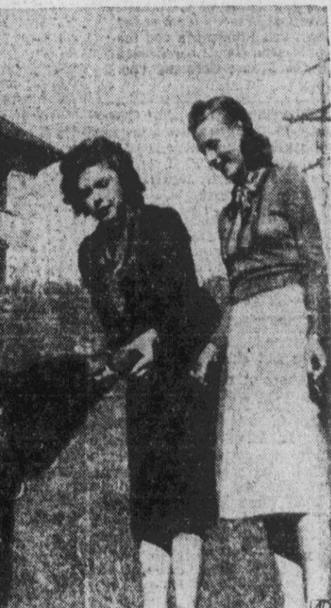
THE CO-EDS' PRIDE at Lees-McRae college at Banner Elk, N. C., is "Grizzly," a bear who's the campus man-hater.