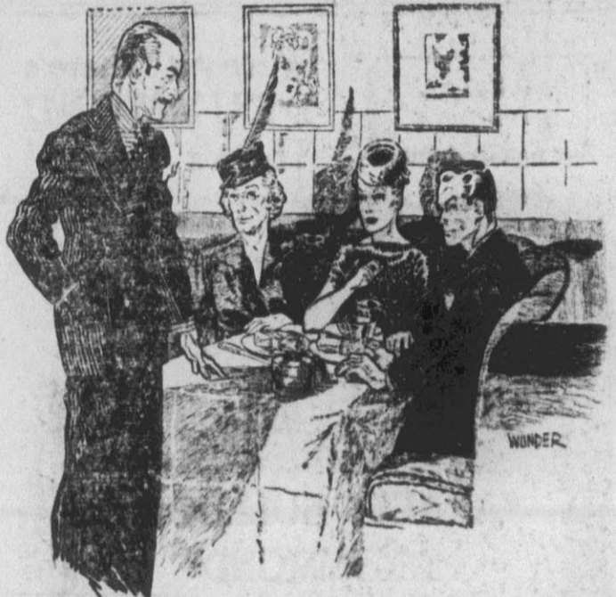
Noel wished David wouldn't show his feeling for her so obviously.

The Security "YOU said that beautifully," Allan's eyes verified the admiration of his words. "I'm sorry I