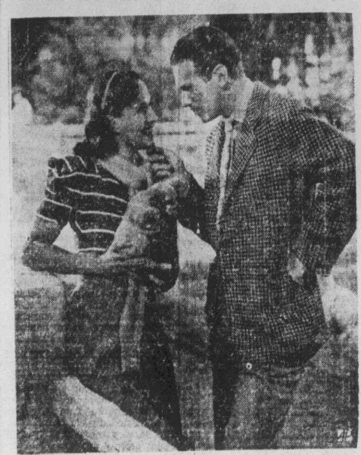
Movie-of-the-Month — Douglas Fairbanks, Jr. and Paulette Goddard in "The Young in Heart."