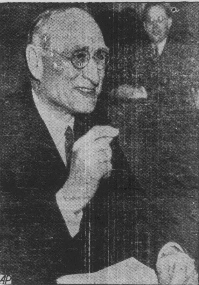
Shows on the stand before a congressional committee, Dr. Arthur E. Morgan, whom President Roosevelt ousted as chairman of the Tennessee Valley Authority, declared the present TVA board has adopted a policy "dangerous" to flood control and had demonstrated a "lack of responsibility." He testified at Washington before the special committee investigating TVA.