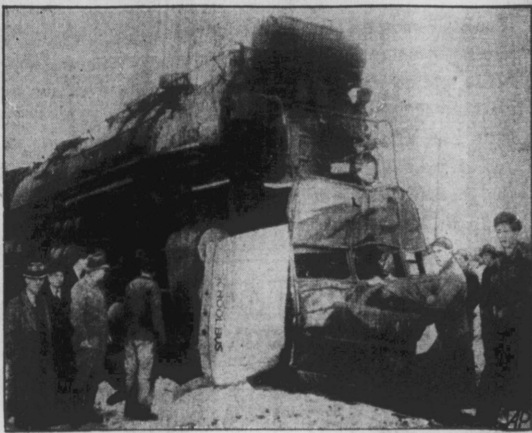
Twenty-three school children died when a fast freight train crashed into a loaded school bus during a snow storm near Salt Lake City, Utah. At least a dozen others suffered injuries. All the victims were between 12 and 16 years of age. Here is part of the wreckage.