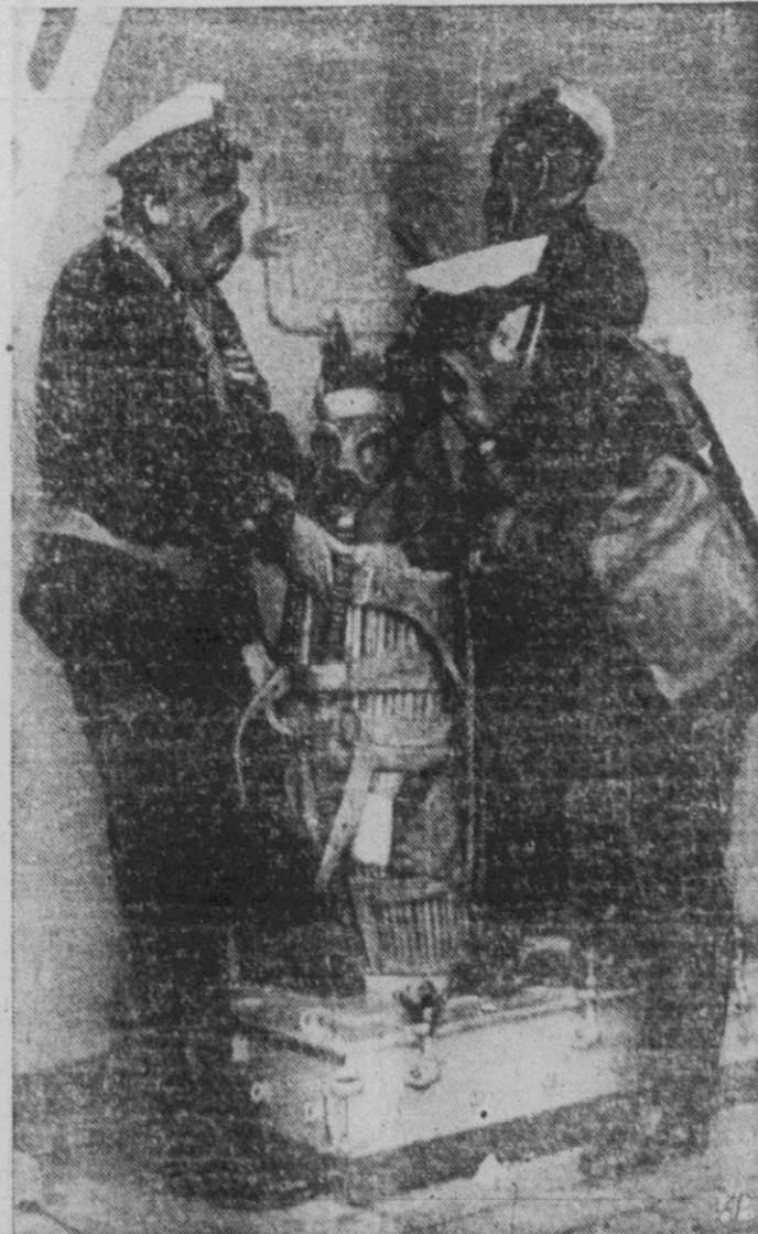
SHIPBOARD CASUALTIES are removed from lower decks in an envelope stretcher designed for this purpose and demonstrated (above) by a medical party aboard the Australian cruiser, Sydney, following battle practice off Jervis Bay.