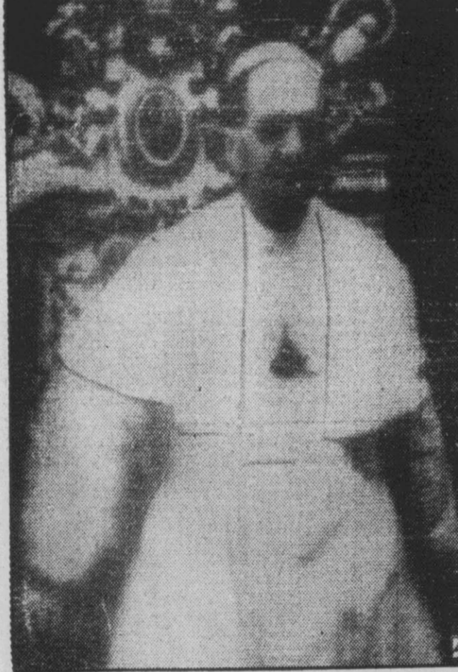
In spite of his critical illness, Pope Pius is shown on his feet in this radiophoto as he astonished 400 pilgrims by appearing before them in the Vatican for a 10-minute address. The pontiff stands in front of the papal throne on which he seated himself unaided a moment later.