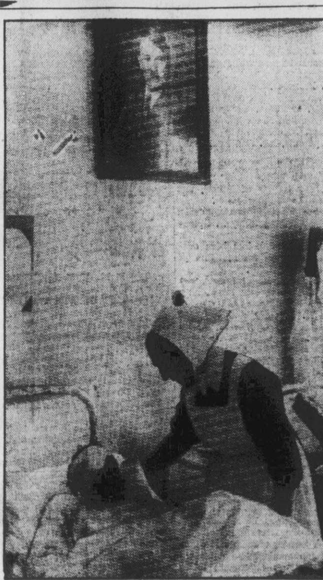
This picture, sent across the Atlantic by radio, was made in a hospital at Seidenberg, Germany, September 20 as a nurse leaned over one of the German customs officials reported wounded by bullets fired by Czechoslovakian border raiders. The clash was one of a series between Czechs and Sudeten Germans. Note the picture of Adolf Hitler, on the wall.