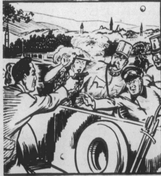
A STUDENT SHOOTS AT ARCHDUKE

One day, in 1870, Chancellor Bismarck of Germany received a telegram from his king. It announced that France's Napoleon III had demanded an apology from King William and a promise to keep a German prince from the throne of Spain. Bismarck made the telegram public. His prestige hurt, Napoleon declared war on Prussia. But the rise of Germany as a united power, and Napoleon's position in France, had long made such a war probable.