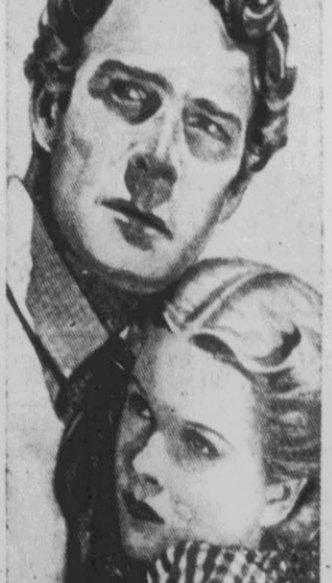
Deserting his usual role Edw. G. Robinson plays the part of prosecutor in "I Am The Law."