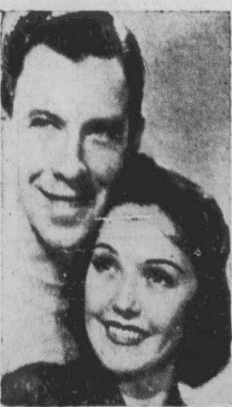
George Murphy and Marjorie Weaver romancers in "Hold That Co-ed" opening at the Pitt Tuesday.