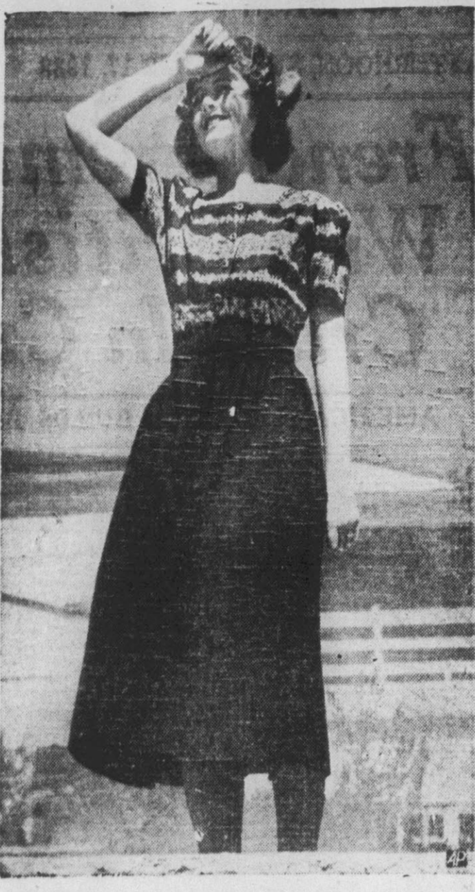
For idle hours at her California ranch, Myrna Loy, of the movies, chooses a blue flannel dirndl skirt and a casual blouse of floral-striped wool challis. The blouse, whose colors are green, beige and blue, is fastened with little plastic ring buttons.