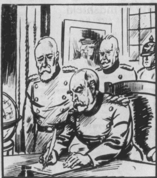
BISMARCK RELEASES A TELEGRAM

The South's bombardment of Fort Sumter, in the harbor of Charleston, S. C., led directly to civil conflict. One day after the fort surrendered, April 14, 1861, President Lincoln called for 75,000 men, and the war was on. But the bombardment of Sumter was only the climax of a long political struggle between the North and South over states' rights, slavery, and economic factors. A clash had been brewing for several decades.