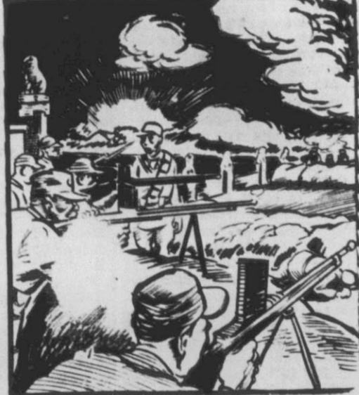
OUTPOSTS CLASH AT MIDNIGHT

Archduke Francis Ferdinand, nephew and heir of Austria's emperor, was assassinated with his wife at Sarajevo, Austria, June 28, 1914, by a Serb. One month later, Austria declared war on Serbia, and the World War was under way. That war had been brewing for half a century, however. European powers, heavily armed and divided into two major alliances, probably would have found some other excuse to fight had not the archduke been assassinated.