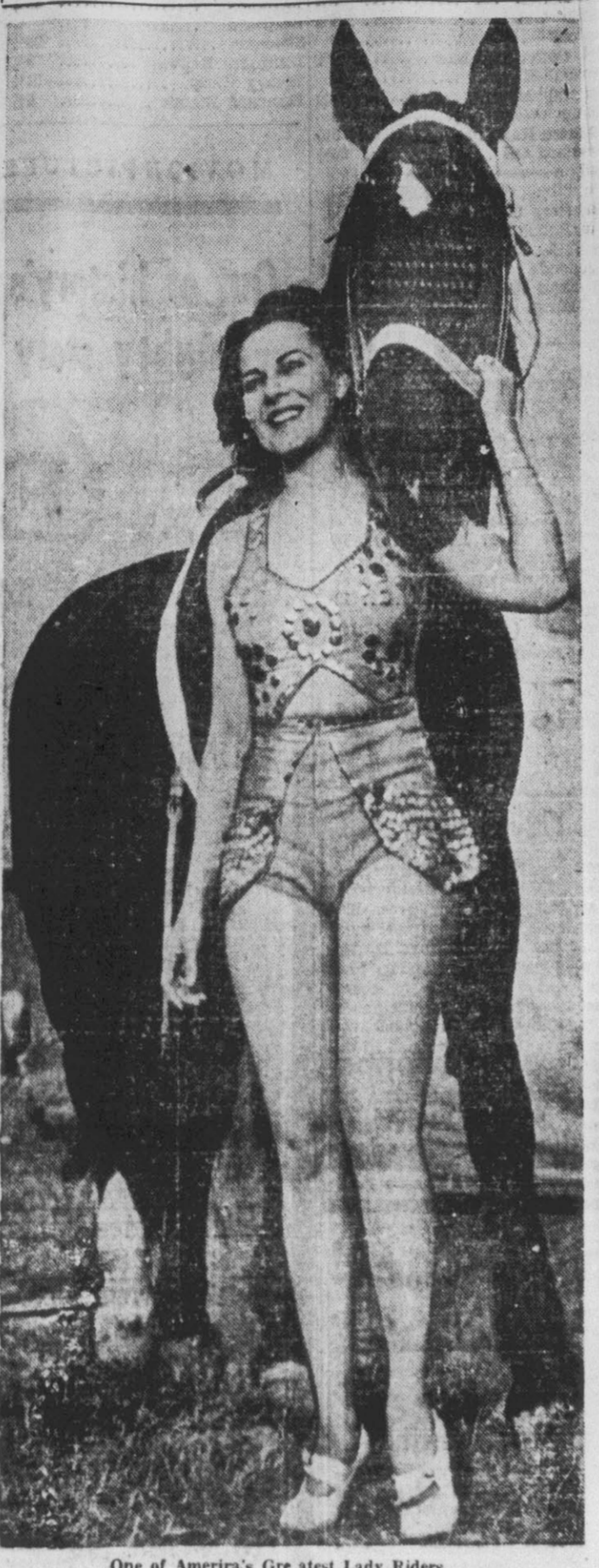
One of America's Greatest Lady Riders

has been a Republican. The editor in a Georgia town speaks the same language as the editor in a Massachusetts community. The Southern lawyer and the Northern doctor see eye to eye economically.