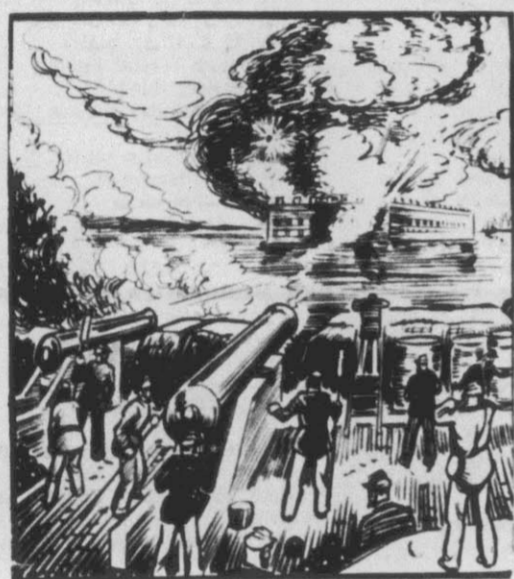
SOUTH BOMBARDS FORT SUMTER

The South's bombardment of Fort Sumter, in the harbor of Charleston, S. C., led directly to civil conflict. One day after the fort surrendered, April 14, 1861, President Lincoln called for 75,000 men, and the war was on. But the bombardment of Sumter was only the climax of a long political struggle between the North and South over states' rights, slavery, and economic factors. A clash had been brewing for several decades.