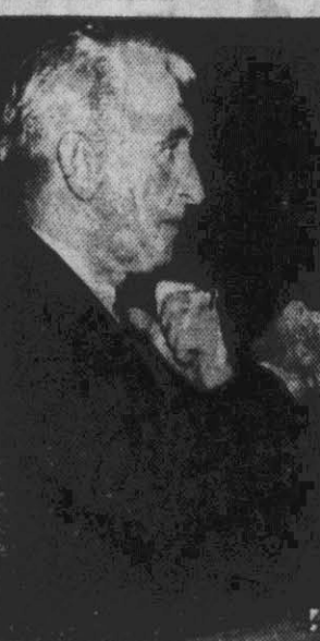
Fightin' words come from Georgia's senior senator, Walter F. George, whose resistance to "purge" in the September 14 primaries makes the Georgia election a critical one from administration's standpoint. F. D. R. opposes George.