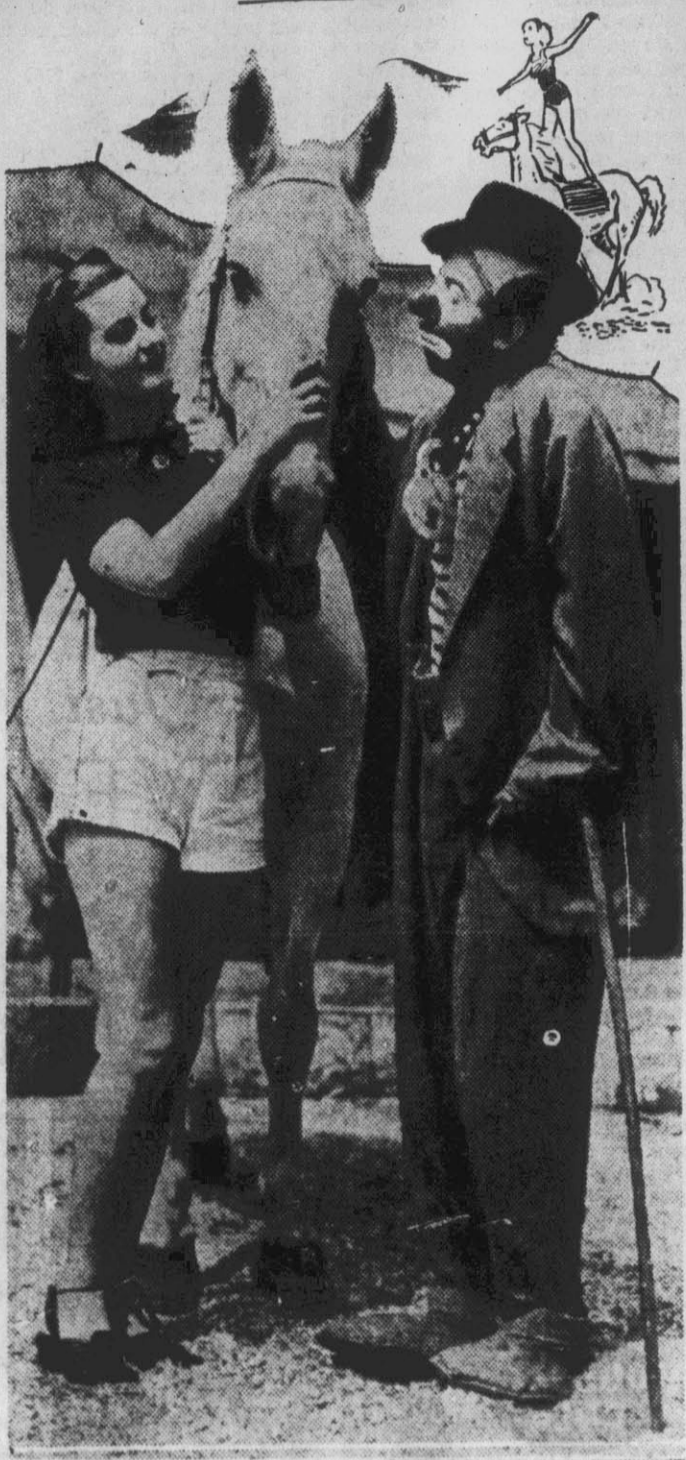
NO CIRCUS WITHOUT CLOWNS AND GIRLS

Hurrah! It will soon be circus time. Men may come and empires may crumble, but circuses go on forever. The Robbins Bros. combined shows with Hoot Gibson, famous Western screen star, is coming to Greenville Tuesday, Sept. 20 at the old Fairgrounds, for performances at 2 and 8 p. m. Doors to the menagerie will open at 1 and 7 p. m.