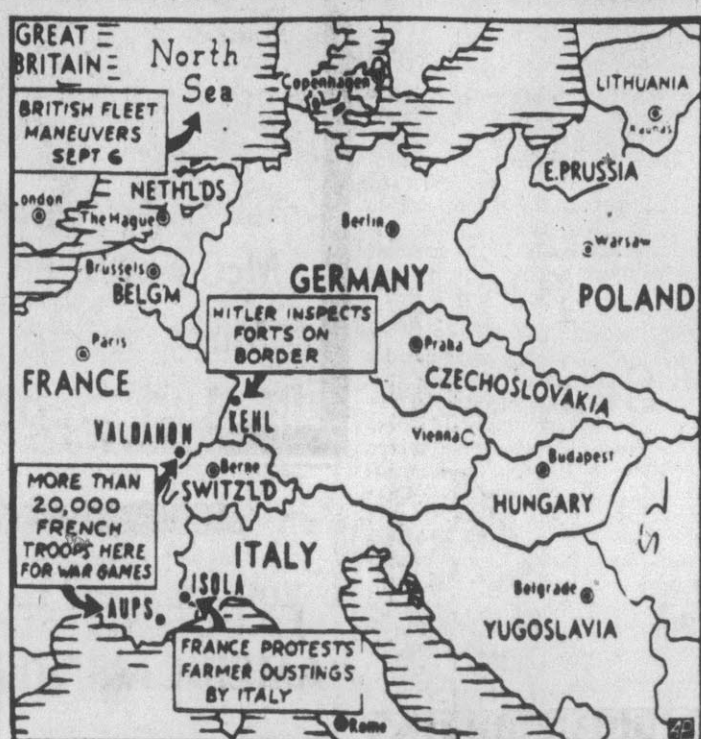
A tense European situation became even more tense when Chancellor Adolf Hitler of Germany made a surprise trip to inspection to forts along the French-German border. Here's a map locating the high spots of the last-minute news.