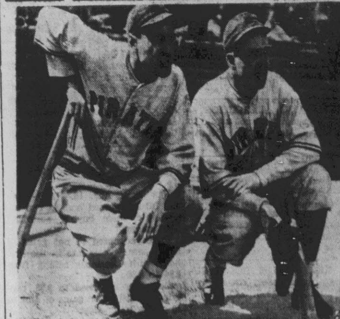
A SERIES CLINT shines in eye of Manager Pie Traynor (left) as he and Catcher Al Todd watch the Pirates steaming up for the National league's cut in October world series.

Greenville's swimmers have garnered victories in every meet in which they have taken part this season. Another meet is being planned for this city some time in the near future.