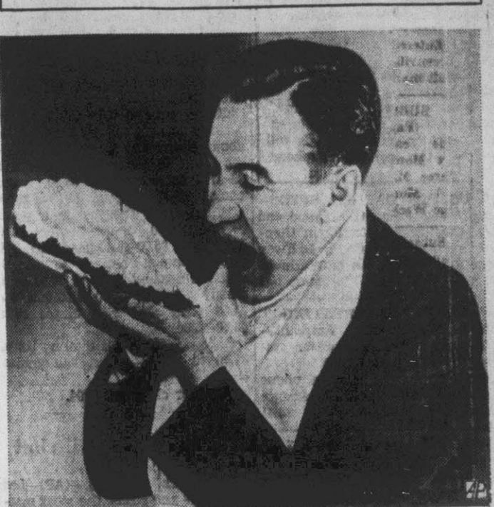
ON THE RECORD, pictorially, is view of Pie "Harold J." Traynor, Pirates manager, getting chummy with a pie on a California movie lot—to indicate a fondness for it. But there's dispute as to how Pie got his nickname.