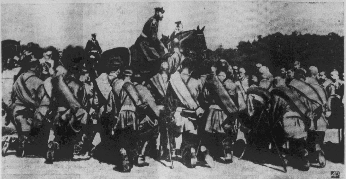
The late Czar Nicholas gives his benediction and distributes images of saints as Russian troops depart to fight the Japanese in 1904.

Russia and Japan have declared a truce. If it clicks, there won't be another big-scale Russo-Japanese war—not right now, anyway. But there still is plenty of chance for trouble. This story tells what happened in the first war.