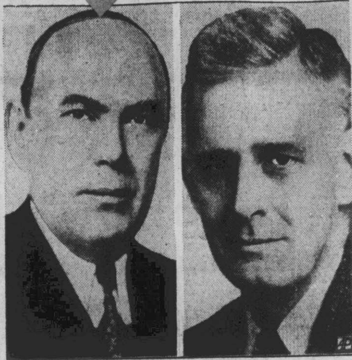
Here are two of Tennessee's Democratic candidates whose rivalry partially is responsible for the tense situation which caused an order to send troops to Memphis for guard duty during the primary August 4. An injunction, however, was signed by the courts to restrain the presence of troops. United States Senator George L. Berry (left) is seeking nomination for re-election with Governor Browning's backing. A Tom Stewart (right) of Winchester, one of Berry's opponents, is supported by E. H. Crump, Memphis political boss, who is Browning's arch political foe.