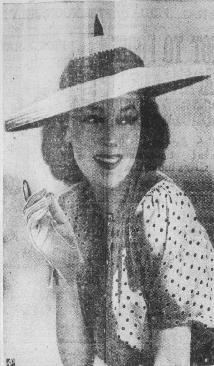
HOLLYWOOD HOT WEATHER HAT—Maureen O'Sullivan wears this big hat of natural colored straw with an inverted saucer brim under California suns. Deep blue grosgrain ribbon trims it. Her beige frock is polka dotted in blue and her short doeskin gloves stitched in the same shades.