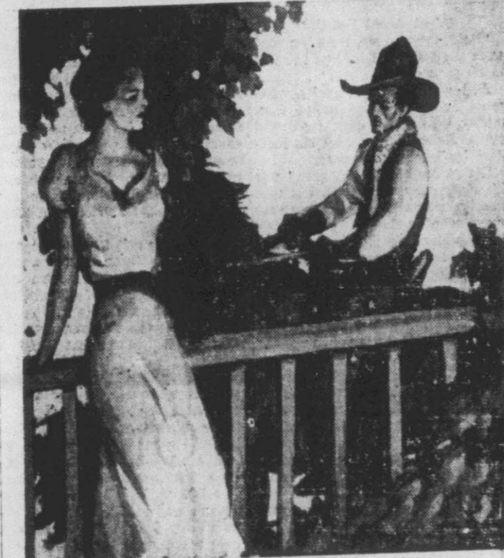
Lee called him softly.

"To The Last Gasp!" "THERE'S an unpleasant change come over you in the last few days. If you don't like it here you're free to leave when the no