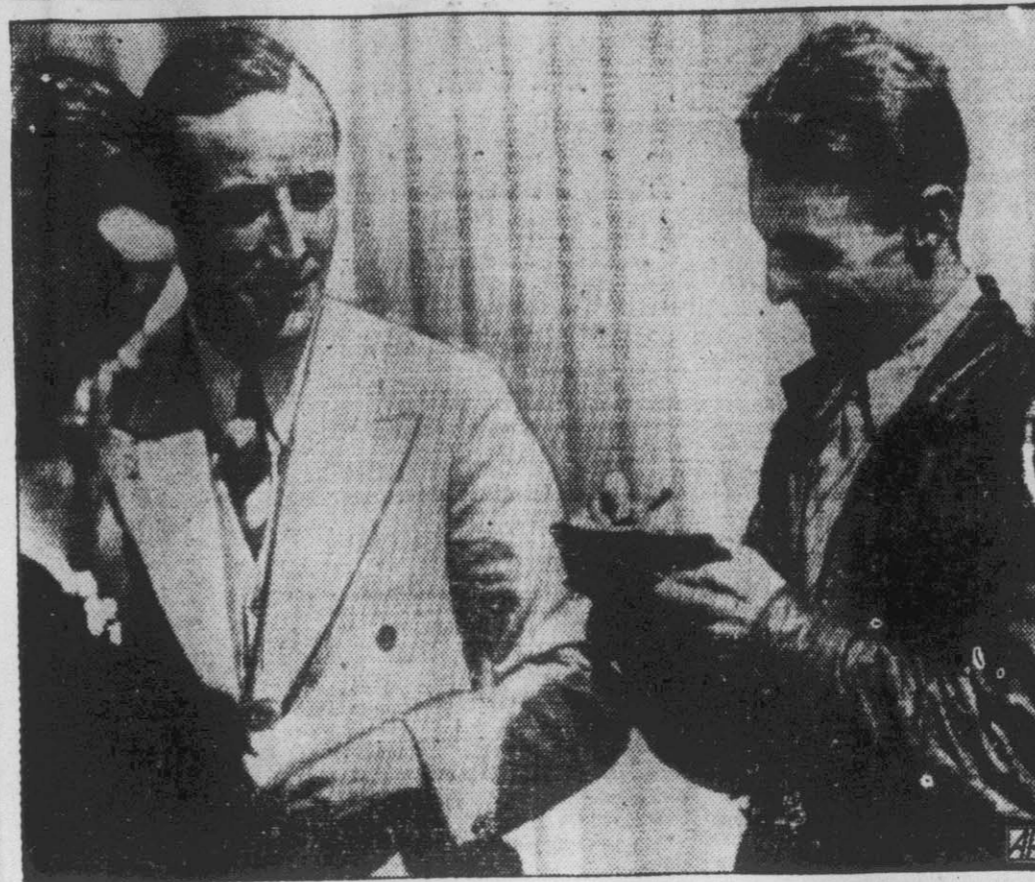
Here is smiling Douglas Corrigan (right) as he signed autographs at Baldonnel airport near Dublin, Ireland, at the end of his flight from New York. This picture of the quiet California youth, who has captured the fancy of the world, was sent across the Atlantic by radio.

resistance to infection. But it is true that when the diet is lacking in protective elements and is quantitatively inadequate, the individual becomes more susceptible to infection.