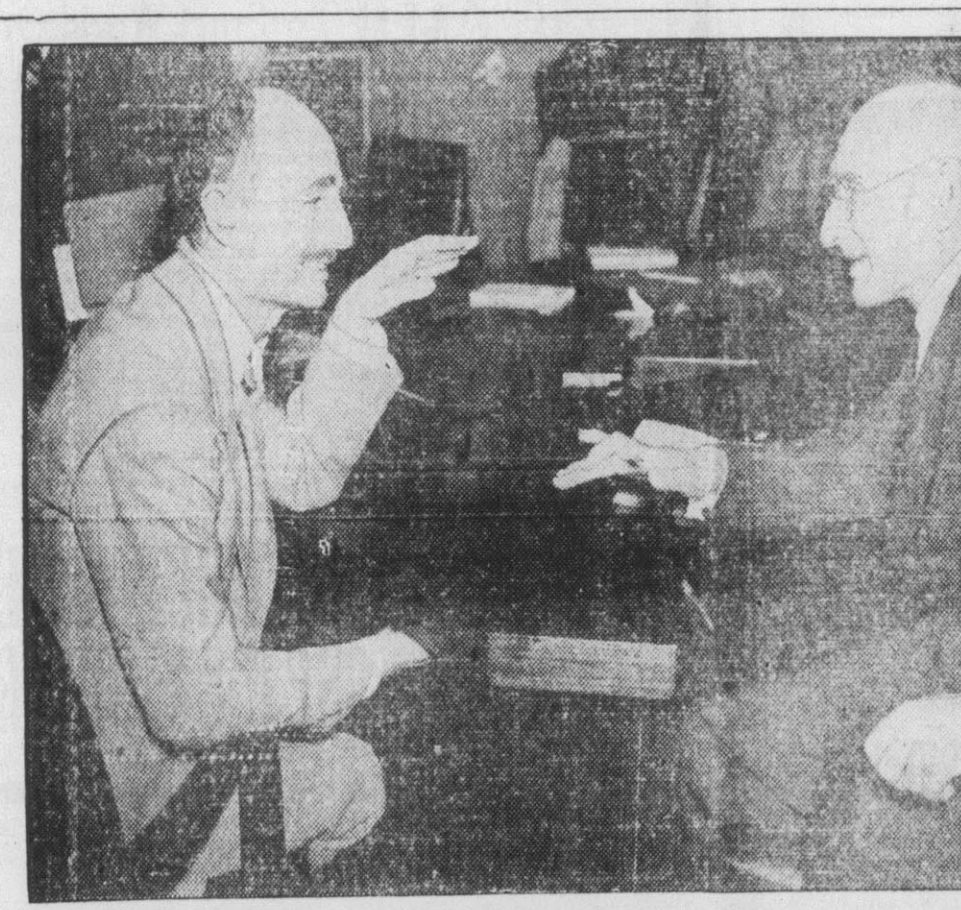
Asserting that TVA officials had instructed employees of the Authority "not to talk" to him and that he could question them only through Francis Biddle, committee counsel, Dr. Arthur E. Morgan, denounced chairman, turned the probe gathering at Knoxville, Tenn., momentarily into an uproar. Here Morgan (right) is cross-examined before the congressional committee by Biddle—only it looks like both rae talking at the same time.