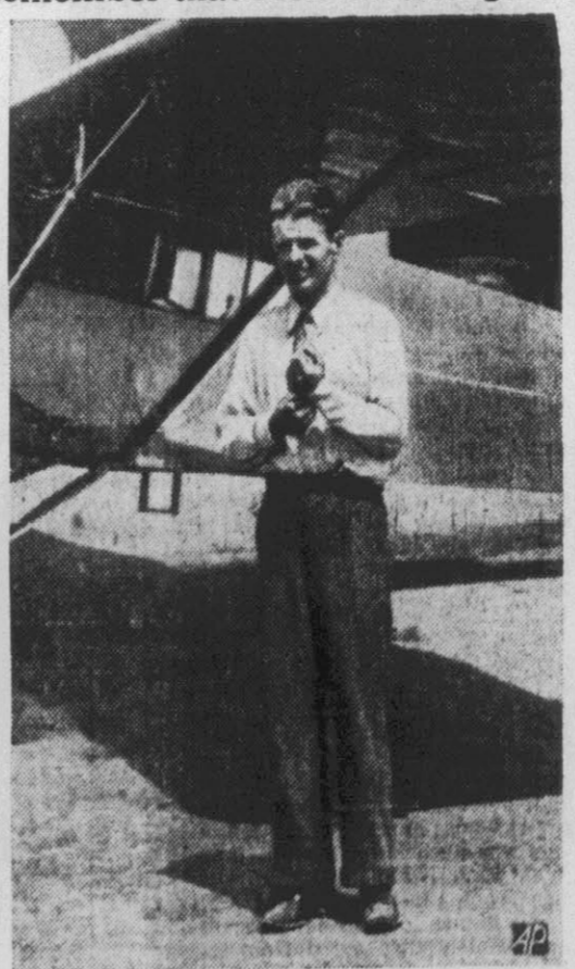
Douglas G. Corrigan and his 9-year-old "flying crate" July 17, 1938

(By The AP Feature Service) Another "flying fool" has written his name in aviation's books.