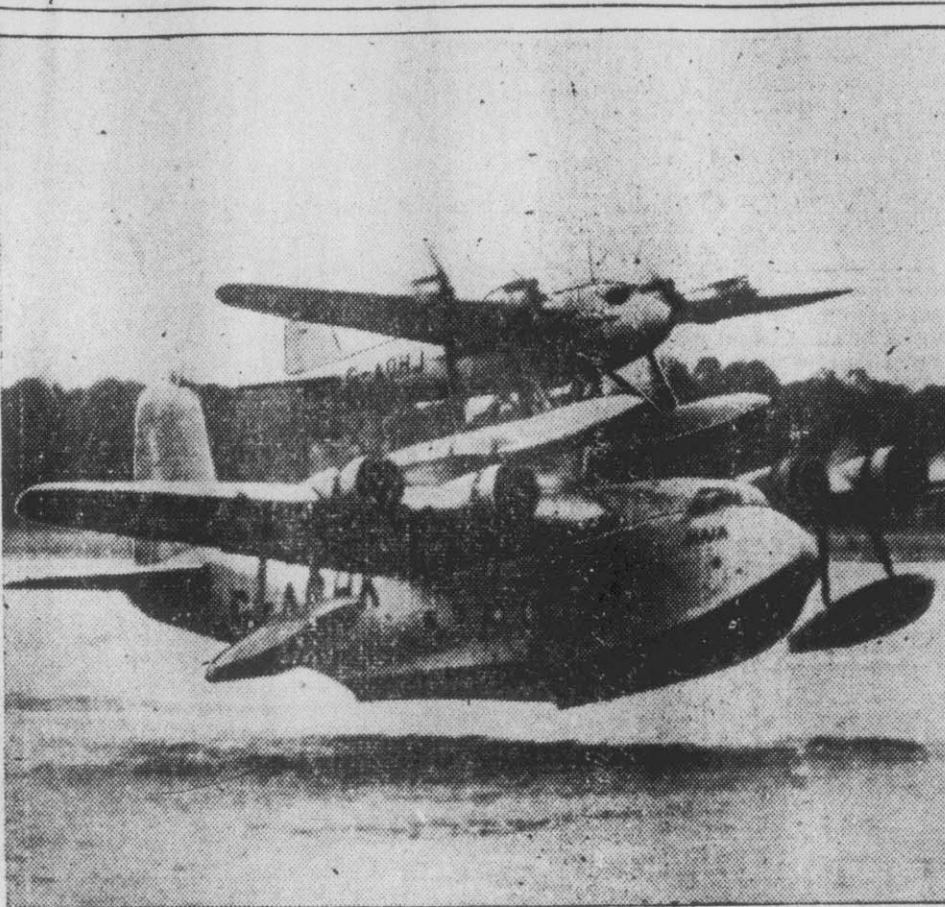
Thirteen hours 29 minutes after leaving Foynes, Ireland, Britain's speedy pick-a-back plane Mercury here shown hooked above the mother plane Maia during a test launching over Cape Bauld, New Brunswick Settlement, in Canada, on her way to New York. She carried a cargo of newspapers, newsreels and news pictures of the experimental flight, forerunner of a projected regular transatlantic service. Once in the air, the Mercury and the Maia parted company perfectly. The Mercury landed at Montreal first for refueling and then speeded on to New York, where she landed safely in Long Island Sound.