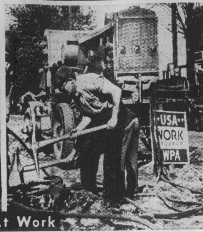
Men At Work Pictures illustrate the wide range of WPA activities, Left, instructor and pupil in a wood-working class, part of a recreation project at Newark, N. J. Right a road project at Erie, Pa.