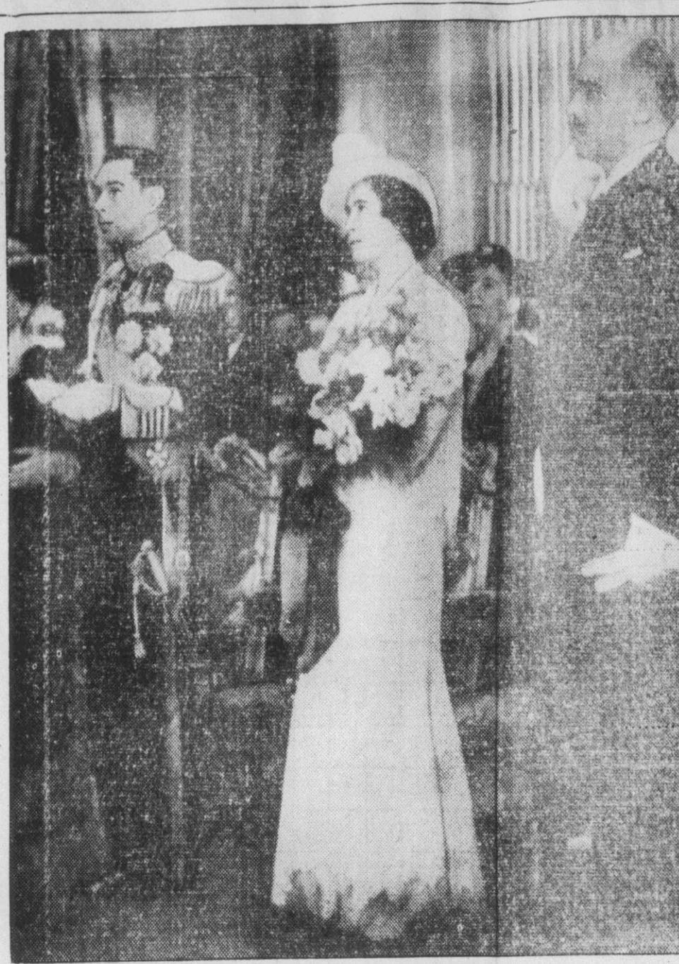
With their official host, President Albert Lebrun (right) of France, King George and Queen Elizabeth of England are shown in this radiophoto as they listened to an address welcoming them to France at the Paris City Hall.