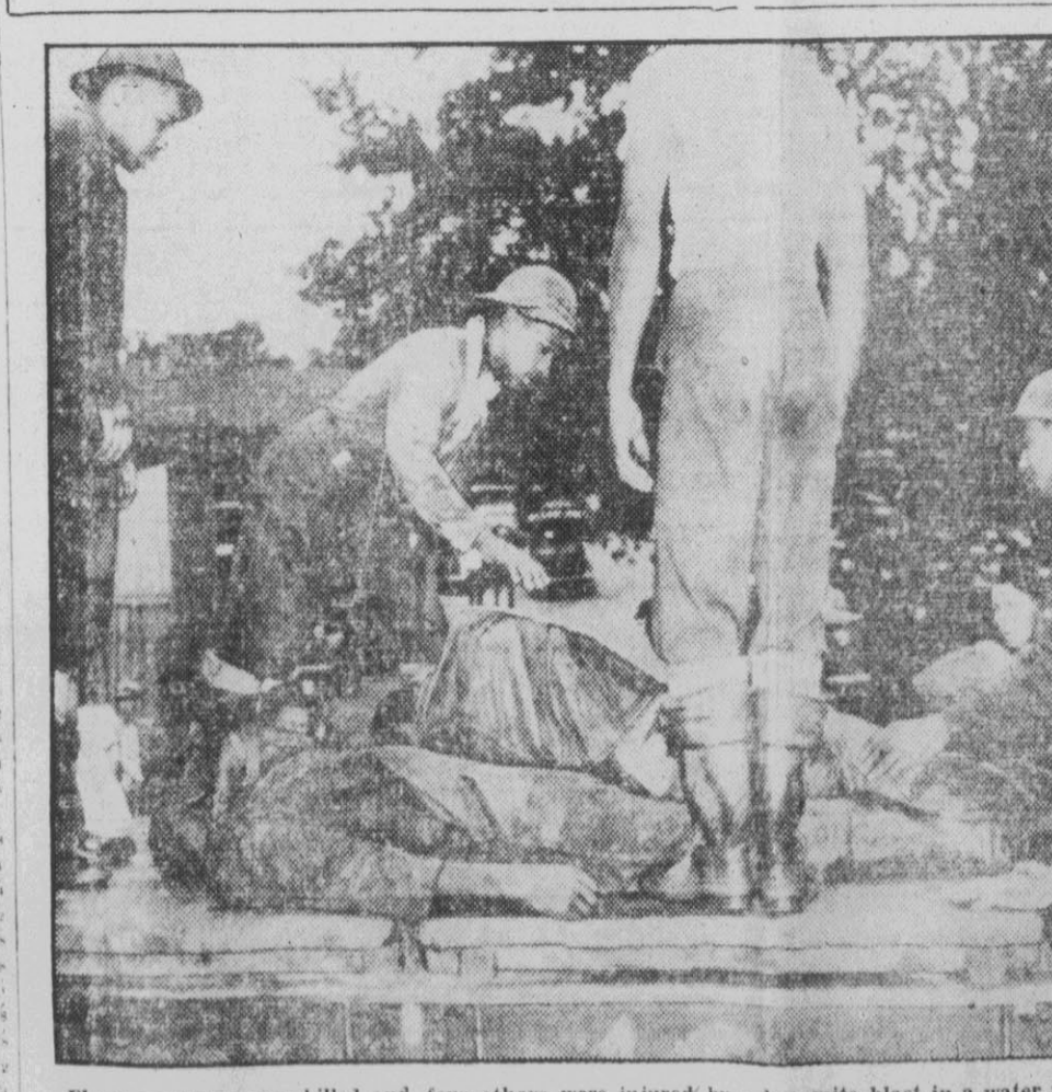
Eleven workmen were killed and four others were injured by a dynamite blast in a water tunnel under construction far under ground at Baltimore. Rescue crews are shown bringing the bodies to the surface and laying them out to await identification.