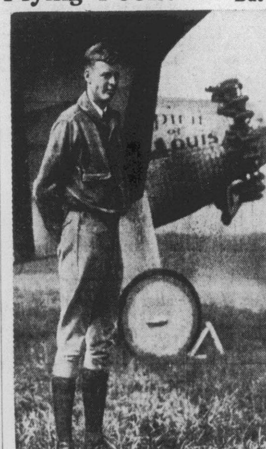
Charles A. Lindbergh and "The Spirit of St. Louis," May 19, 1927.