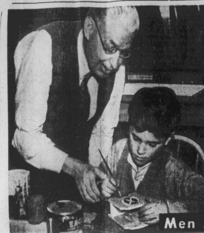
Men At Work Pictures illustrate the wide range of WPA activities, Left, instructor and pupil in a wood-working class, part of a recreation project at Newark, N. J. Right a road project at Erie, Pa.

No Easy Way Out The most prominently mentioned plan is the Republican suggestion that the federal government match