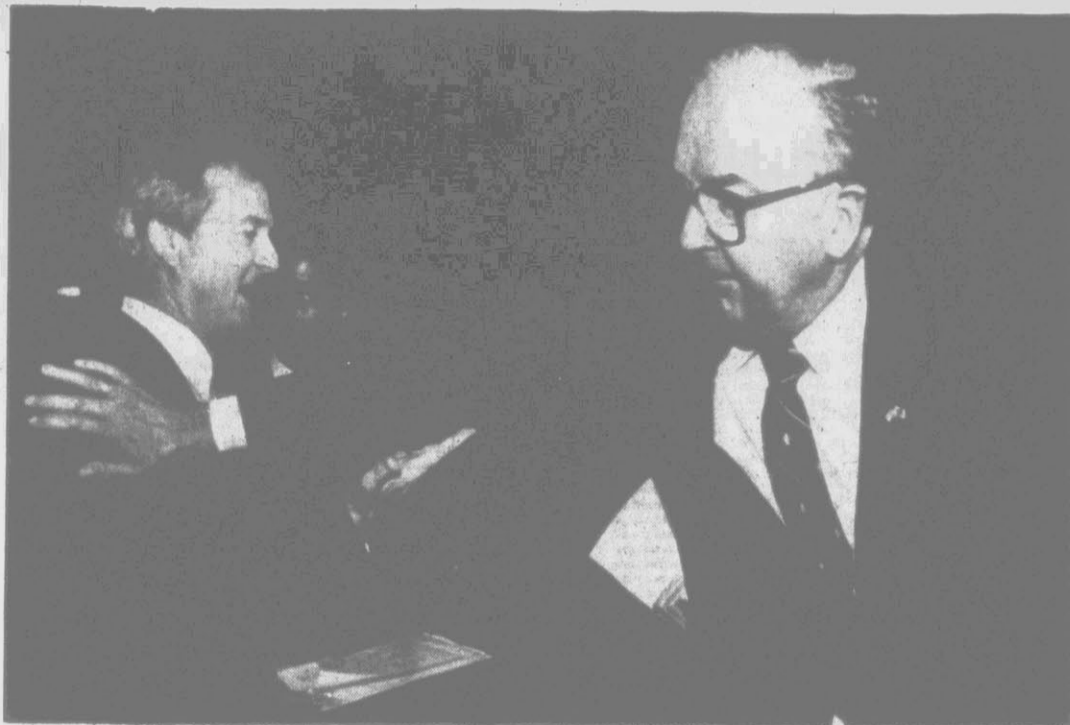
CANDIDATES PART — U.S. Sen. Jesse Helms, Sunday night between the two candidates. R-N.C., right, gives Democratic opponent Gov. Jim Hunt a pat on the shoulder following the first televised debate