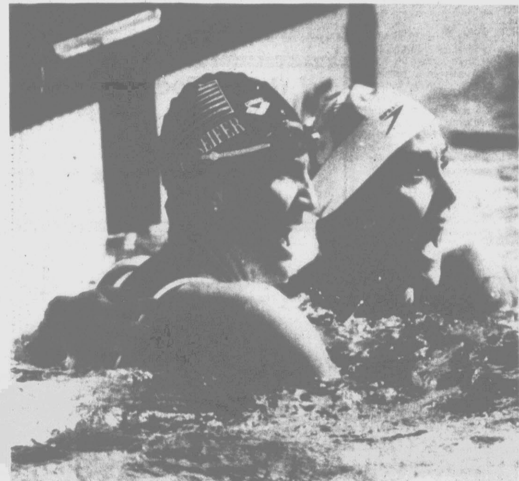
The Winner(s) Nancy Hogshead (L.) and teammate Carrie Steinseifer react as they watch their times in the finals of the 100-meter freestyle Sunday at the USC Swim Stadium. The women both received gold medals, as the electronic timers recorded the finish as a tie at 55.92.