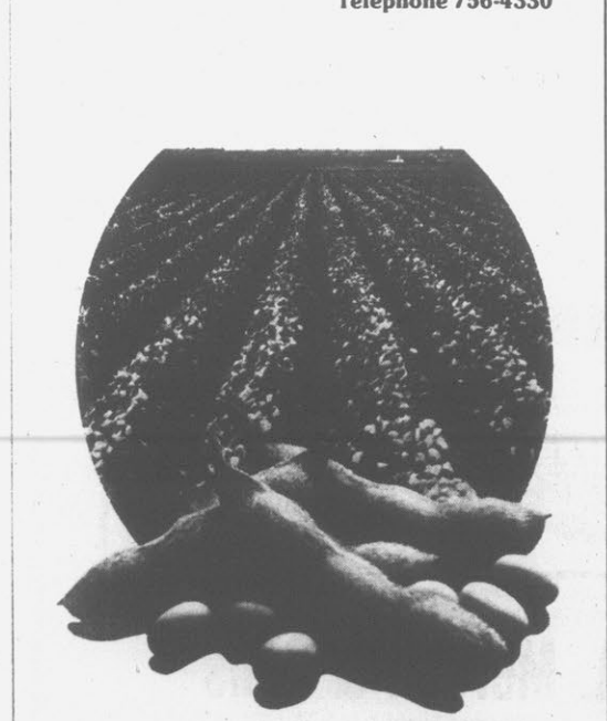
Registered trademarks of Swift Agricultural Chemicals Corporation

This is generally accepted as the preferred formula for our area. If you need a special soil analysis and recommendations for an individual formula for your crops, call us. SWIFT® Certified Harvest King® Howell & McClellan Sts. Greenville, N.C. Telephone 756-4330