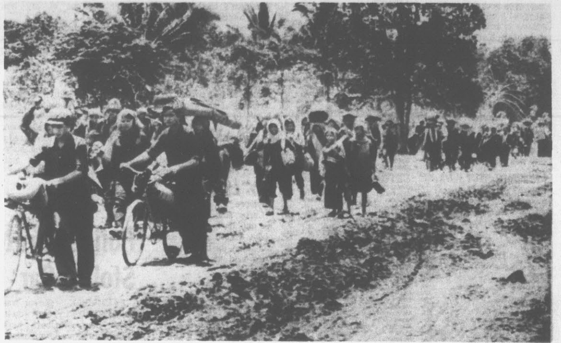
PUSHING BICYCLES AND BELONGINGS — Bringing their bicycles and carrying their belongings with them, 12,000 Cambodian civilians cross the border and enter Thailand late Saturday. A total of 20,000 soldiers and civilians crossed the border to escape the heavy fighting by advancing Vietnamese and Cambodians who are followers of Heng Samrin.