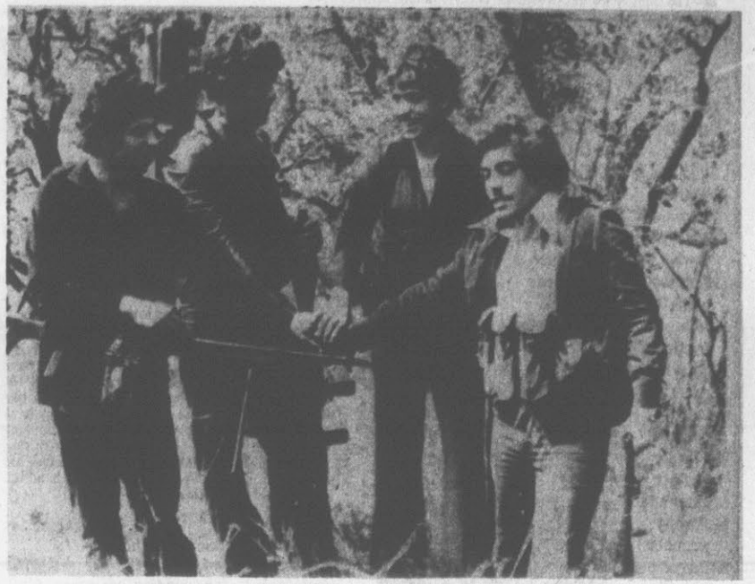
ILL-FATED GUERRILLAS — Photo distributed by the Palestine Liberation Front showing the four guerrillas who early Sunday attacked the Israeli town of Nahariya. They are only identified as in their code names of