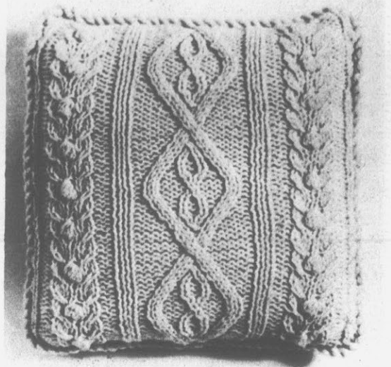
POPCORNS... and cables give this pillow an authentic "Irish fisherman" look.

("Blue-Collar Jobs for Women" is published by Dutton)