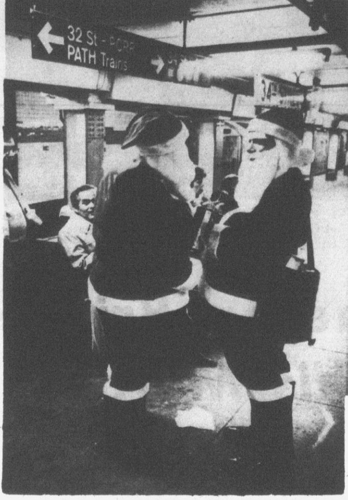
SHOP TALK?—Two Santa Clauses chat as they wait for a subway train at 34th Street stop in New York. Both men identified themselves as "Santa Claus" and "Santa's helper", and said they were on their way to work in a Brooklyn shopping center.