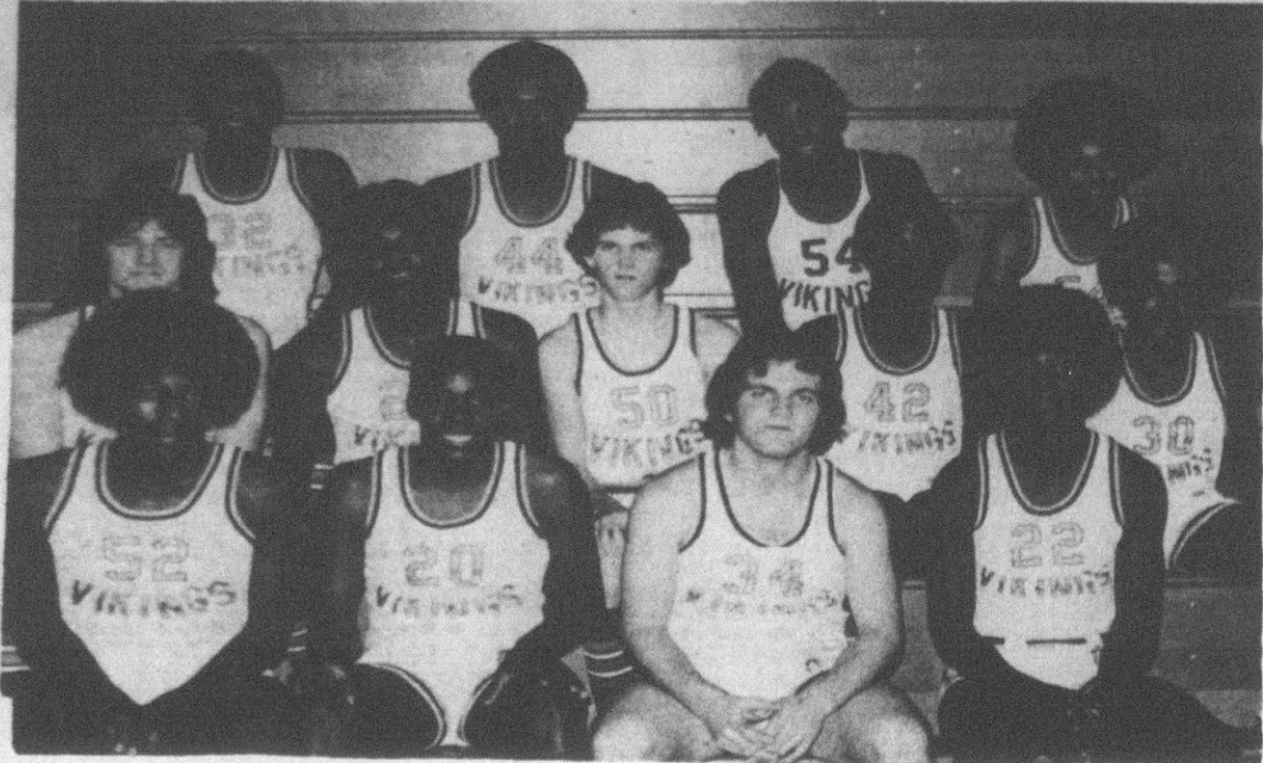
Representing D.H. Conley