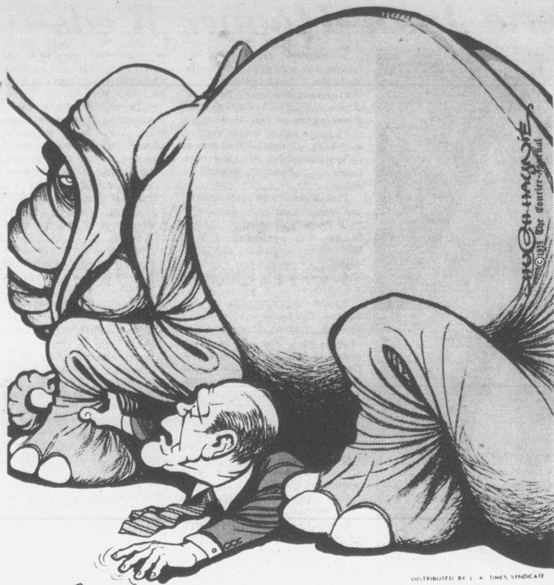
"Pardon me, sir . . . but your position is making my position somewhat difficult."

That fight should draw into sharp focus the main argument raging across the nation: trial lawyers who say that malpractice suits—and jury awards—are skyrocketing because people are finally calling the hands of doctors who have gotten away with sloppy work; and the physicians who say the condition is caused by trial lawyers who grandstand before juries with less than sure cases to get their cut of the money—generally running about one-third of the awards.