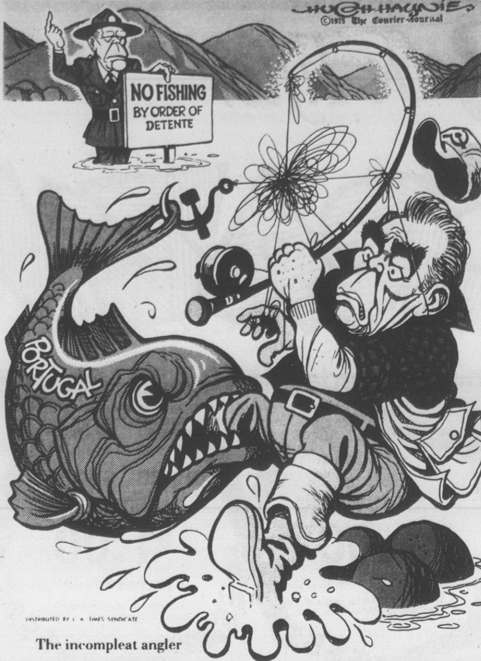
The incomplet angler

times and lose days in court because of delays in bringing the case to trial. He can be subpoenaed for the morning of the trial, sit there all day and then see the case thrown out before he ever testified. Of course, any witness has to be available to the courts to give his testimony, but there has to be a way to make giving testimony less of an ordeal for a citizen who is uninvolved in the crime and merely doing his duty. Possibly something might be worked out so that an eyewitness to a crime could give his testimony at the beginning of the trial and then be on his way. Or perhaps depositions could be used more with the witness submitting to questioning by the opposing attorneys and this written record being introduced into the actual court proceedings. It's easy to say that a witness just has to put up with the inconvenience of going to court, but if a witness simply fails to come forth, then someone is denied justice. There's got to be a better way to make it more convenient for citizens who volunteer to testify in the courts.