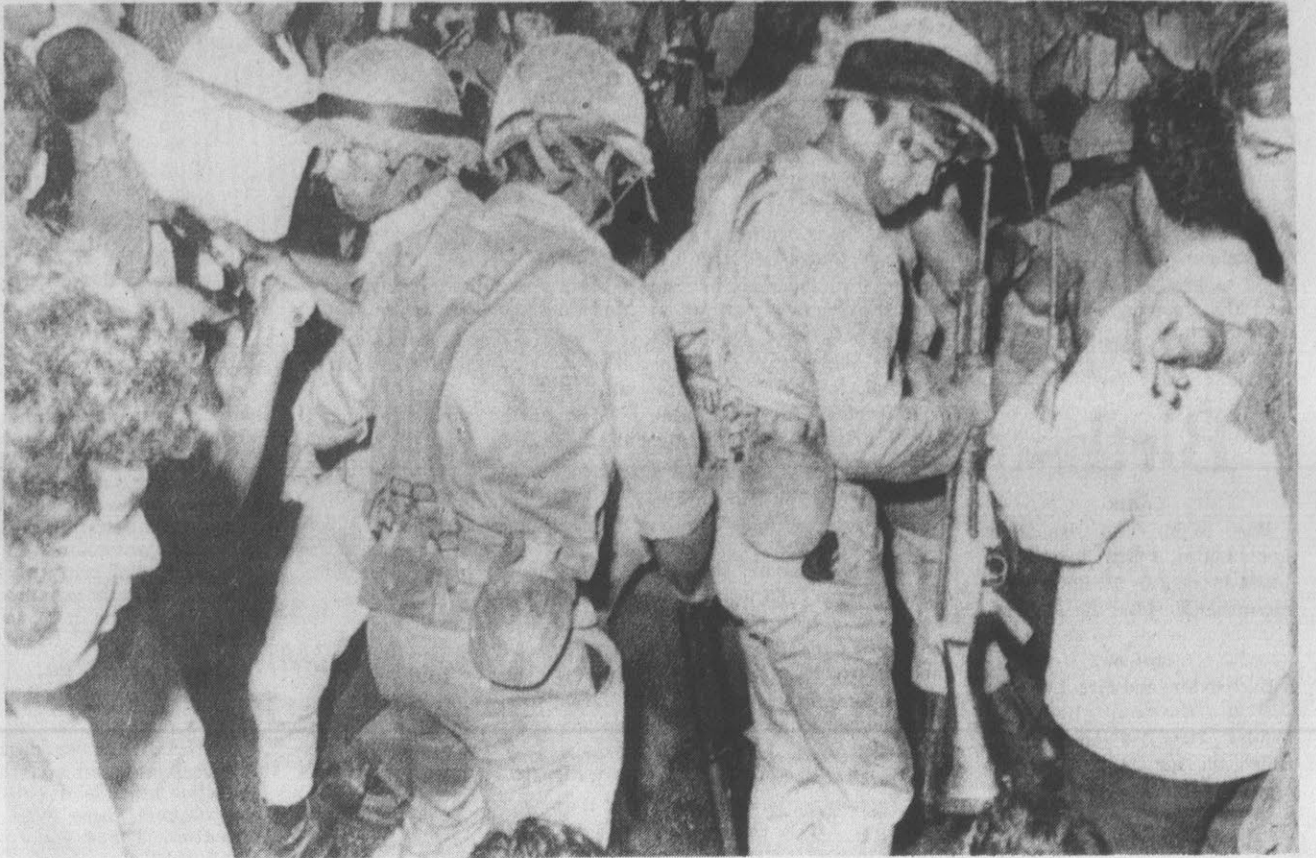
DEMONSTRATORS DISPERSED—Israeli troops in battle gear waded into a crowd of demonstrators outside the Knesset (parliament) in Jerusalem Thursday night, while Secretary of

The sources said the army chief of staff, Gen. Carlos Fabiao, 45, was the choice of President Francisco da Costa Gomes to replace Goncalves as premier and possibly in a three-general ruling junta. Goncalves, Costa Gomes and Gen. Otelo Carvalho, now make up the triumvirate.