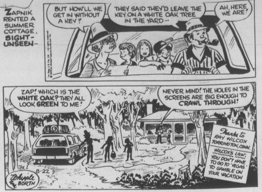
ZAPNIK RENTED A SUMMER COTTAGE. SIGHT-UNSEEN—