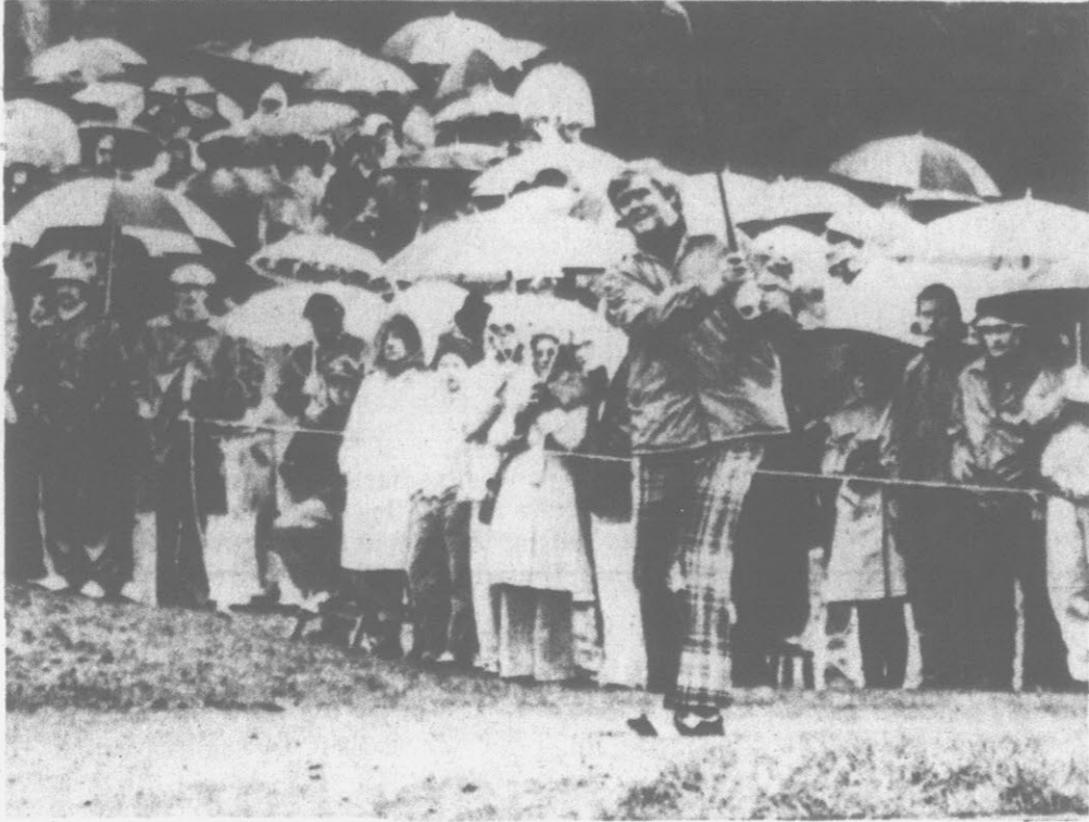
NO DAY FOR GOLF—While the gallery huddles under umbrellas, Gay Brewer hits an iron to a par-3 third green at Cypress Point Thursday during what was to have been the first round of the Bing Crosby National Pro-

Am. Brewer knocked the ball eight feet from the pin and dropped the putt for a birdie, then saw it go for naught when the round was washed out one hole later.