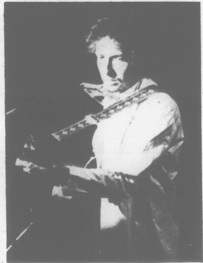
ON THE ROAD AGAIN—Singer Bob Dylan began a six-week tour with a concert in Chicago last night.